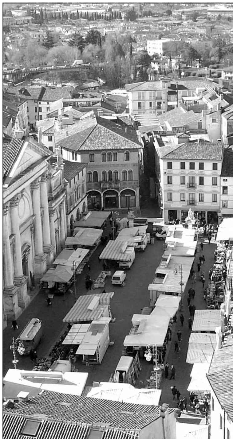
View of Piazza Liberta' , a square in downtown Bassano, from the Torre Civica , the city tower, during a market day. Bassano holds a market twice a week, on Thursday and Saturday. The annual Fiera , fair, also is held in the three squares located downtown.

There again for couch potatoes, chestnuts are readily available in the supermarkets where you can also find farina di castagne (chestnut flour) for your cakes.