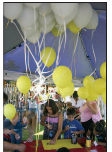
(Top) Families and friends of the 173rd STB release yellow balloons in support of their Soldiers. (Above) Children take time to write messages to attach to their balloons. As a bundle of white balloons representing the fallen Soldiers of the 173rd ABCT, floats above.

Within minutes, the sea of yellow balloons flew higher eventually fading from sight; their mission giving everyone a sense of hope, a moment to reflect and renewed strength to focus on the future.