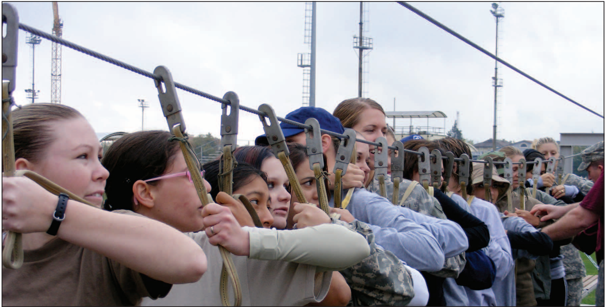
Stand-up. Hook-up. Shuffle to the door. These First Rock women get a basic airborne refresher before they exit the "aircraft."