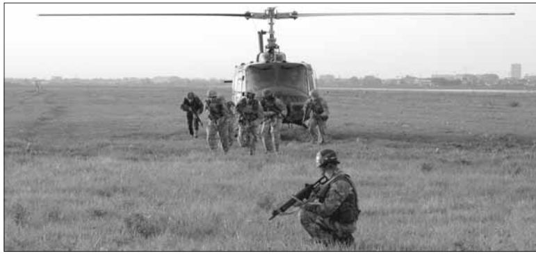
(Above) Soldiers dismantle the UH-1 Huey helicopter during training.