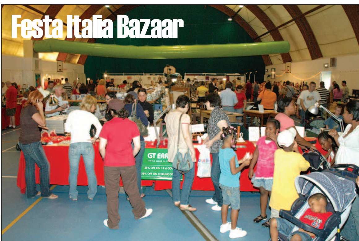
The Festa Italia Bazaar hosted by the Vicenza Community Club Sept. 22-23 brought in more than 60 vendors from around the world to offer their products. Nearly 1,500 people visited the bazaar this year.