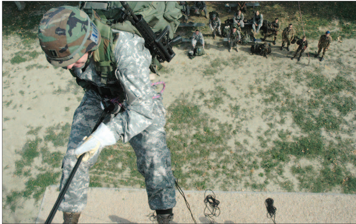
A 13th MP Soldier prepares to rappell down the tower face while fellow Soldiers watch from below.