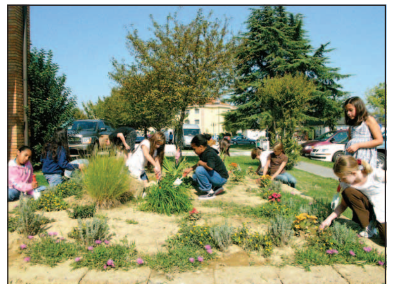
The Vicenza Elementary School got a bit of brightening up last week as the the Elementary School Garden Club used its skills in front of the school house. The garden club is composed of fifth and sixth graders interested in nature and gardening. They planted flowers and decorative grasses in a small area near the entrance of the elementary school.