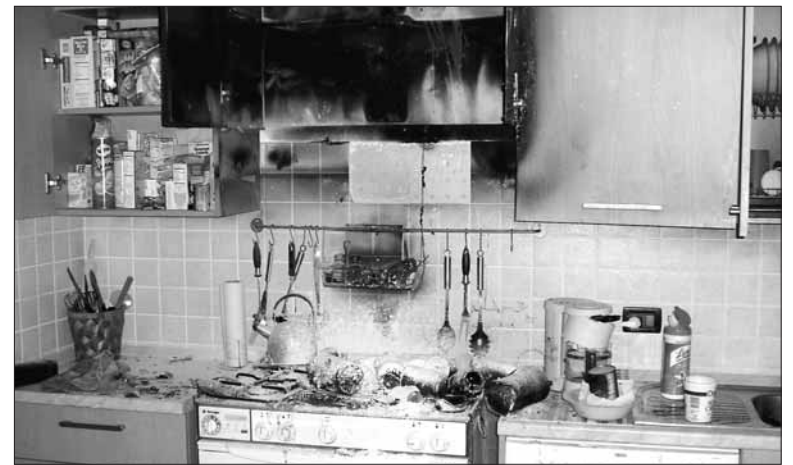
This fire happened in a Vicenza military rental quarters just last week.

Chief Fattori urges everyone to develop home escape plans with all members of the household, and to practice fire drills regularly. He says an adequate escape plan for one and two family dwellings includes everyone in the household knowing two ways out of every room, establishing an outdoor location in front of the home where everyone will meet upon exiting, and knowing the emergency number of the local (115) and installation fire department (0444-718911), which should be contacted immediately from a nearby phone.