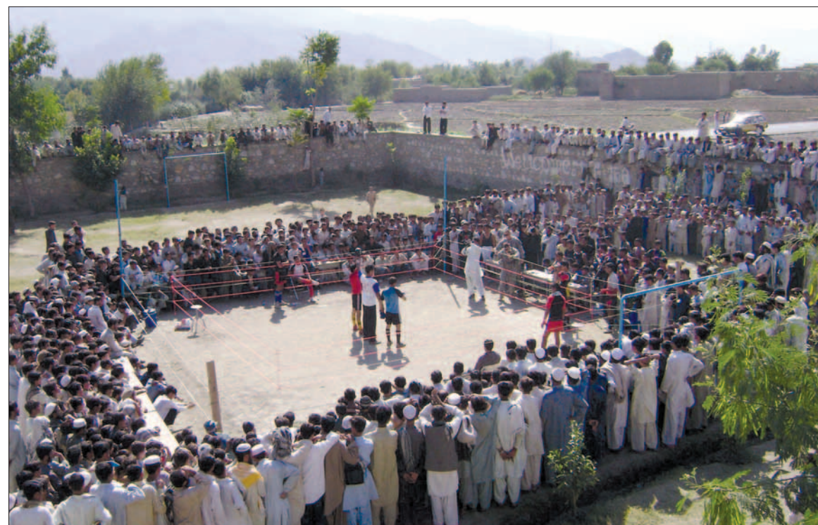
A boxer is declared winner during a boxing tournament in Chowkay, Kunar Province, Afghanistan. Locals called the tournament the first ever to be held there and the event drew nearly 500 people. Sporting events were forbidden under Taliban rule but have proven extremely popular since their demise.