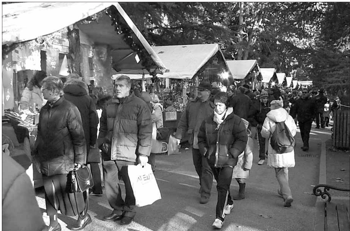
Chalets fill the streets in the Parco degli Aburgo , a park located in Levico - one of the towns in the Trentino region which houses annually a Christmas market. Visitors may find ornaments and decorations for the Christmas tree or the house and gift ideas for the holidays.

Graz , Austria: The oldest Christmas market in Graz takes place around the Franciscan church this year from Nov. 23-Dec 23 from 10 a.m. to 10 p.m. daily, Dec 24 it is only open in the morning. Styrian arts and crafts, regional farm products, hot punch and mulled wine warm the hearts of curious visitors. Near the church entrance, a children's paradise with a merry-go-round, toy stands and a live crib enchant the little ones. Those who would like to see the rest of the Old Town can get on the Advent train.