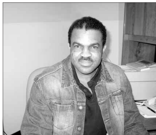
Michael Marshall Davis Soldier and Family Readiness Center