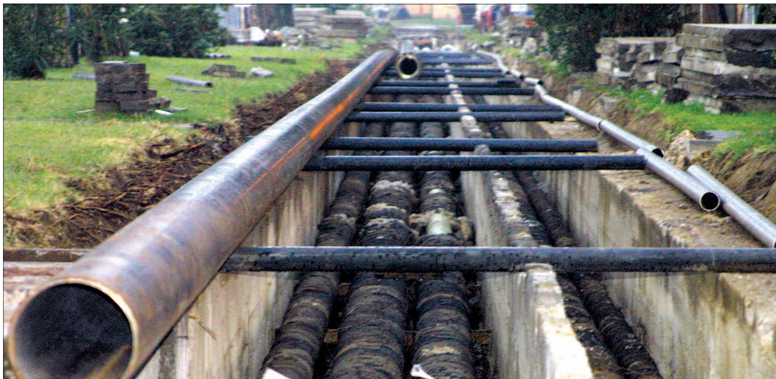
Trenches filled with pipes have dominated the Caserma Ederle landscape for months. Construction projects will continue on the post, in Villaggio and at Longare for many years to come. However, the new facilities will provide better living conditions throughout the community.