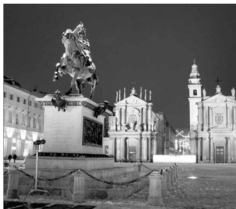
Night view of the San Carlo Square in Torino, with the centerpiece of the equestrian bronze statue of Duke Emanuele Filiberto created by sculptor Carlo Marochetti in 1838. The square is surrounded by elegant palaces and the twin Baroque churches of Santa Cristina and San Carlo, designed by Sicilian architect Filippo Juvarra.

By car: Mirano is located by taking the autostrada A4 towards Venice and exiting at Dolo-Mirano. By train to Mestre then by bus to Mirano.