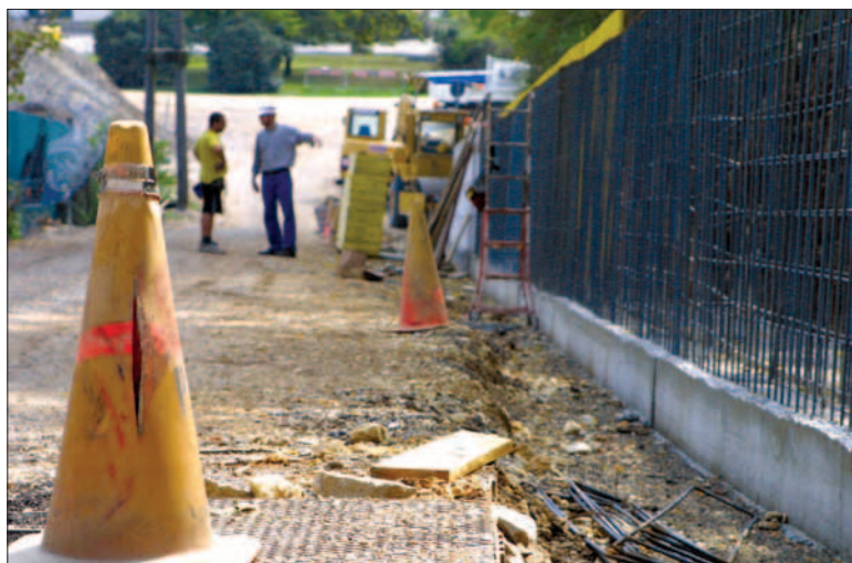
Frequent road closures, temporary utility outages and changes in traffic patterns are becoming a way of life on Caserma Ederle.

A town hall meeting is scheduled for Nov. 13, at Villaggio, to go over these projects in detail, review bus route changes, and go over safety concerns with Villaggio residents.