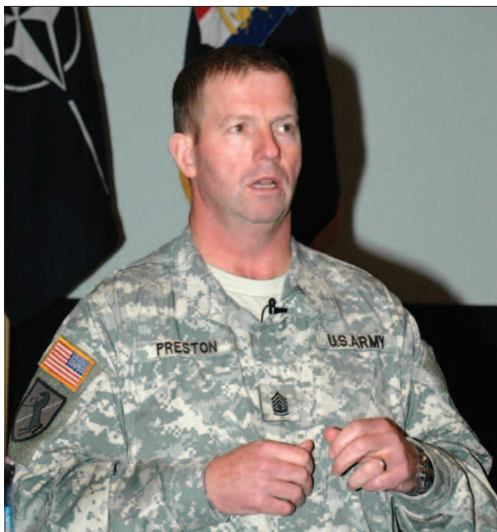
Sgt. Major of the Army Kenneth Preston.

"I am thankful to be here with my wife and kids. My wife is in the Air Force and we are fortunate enough to have been stationed together in Aviano."