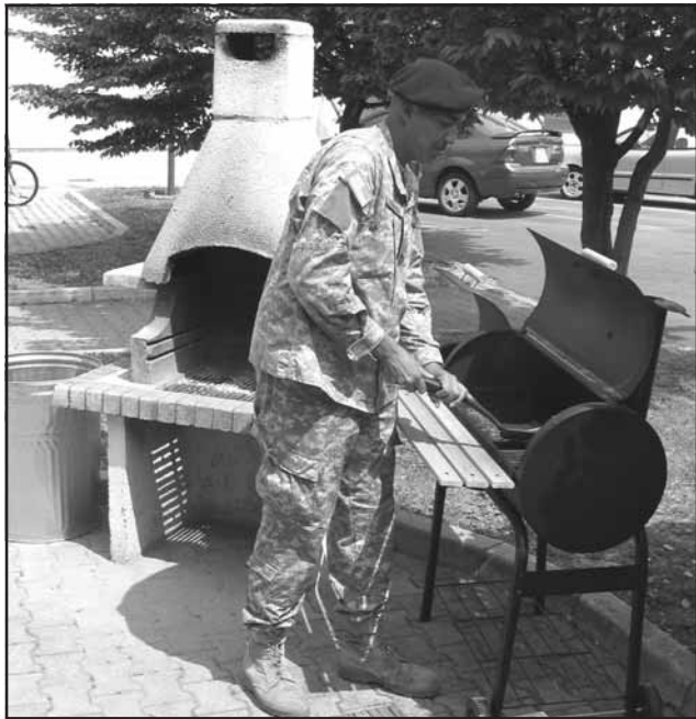
A Soldier with 509th Signal Battalion carefully cleans up the grill used for a battalion get together.

◆ Always read the owners manual before using your grill and follow specific usage, assembly, and safety procedures. Contact the grill manufacturer if you have specific questions. (Be sure to locate your model number and the manufacturer's consumer inquiry phone number and write them on the front page of your manual.)