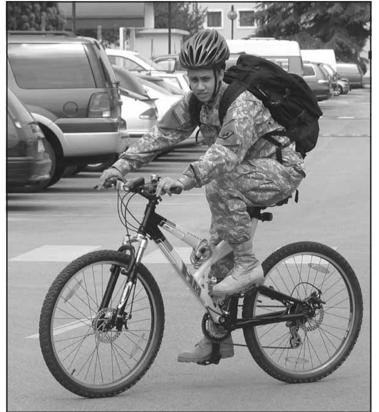
This Soldier is obeying the rules for riding a bicycle on post. She's correctly wearing an approved helmet, her bicycle has a bell and her tires have reflectors in them and her light works.

and your child wear a properly-fitted and fastened helmet. Military Police will cite personnel in violation of this directive. Do the right thing for yourself and your children – wear a helmet and obey the rules of the road.