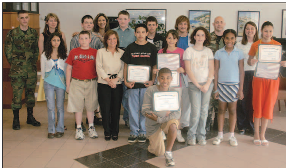
The outstanding contributions of Camp Darby volunteers and members of Youth Service's Passport Promise program were recognized at an awards ceremony April 27.

Organizations that need or want volunteers must post job descriptions on VMIS. This system will allow volunteers to