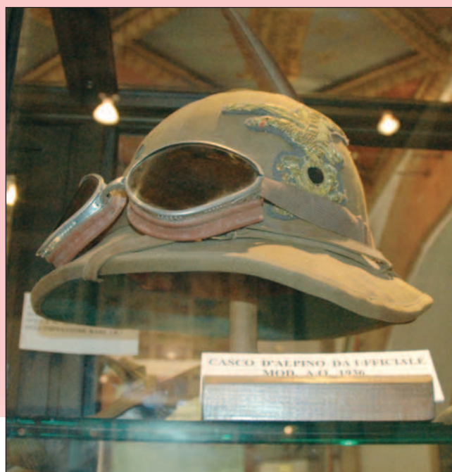
A 1936 model of an Alpini helmet on view in the main room.

(Right) Sign above the entrance of the Museo degli Alpini , which is located in two floors under the taverna , a typical bar on the western side of the Ponte Vecchio , the historical bridge also called Ponte degli Alpini .