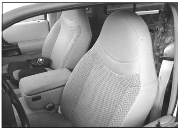
Do not leave personal items in the car when you put it in storage.

Army Claims Regulations do not provide for payment of maintenance damage to stored vehicles. Claims cannot be paid for dead batteries, flat tires, mold, rust, sun damage, mechanical damage, or other lack-of-use damage to stored vehicles.