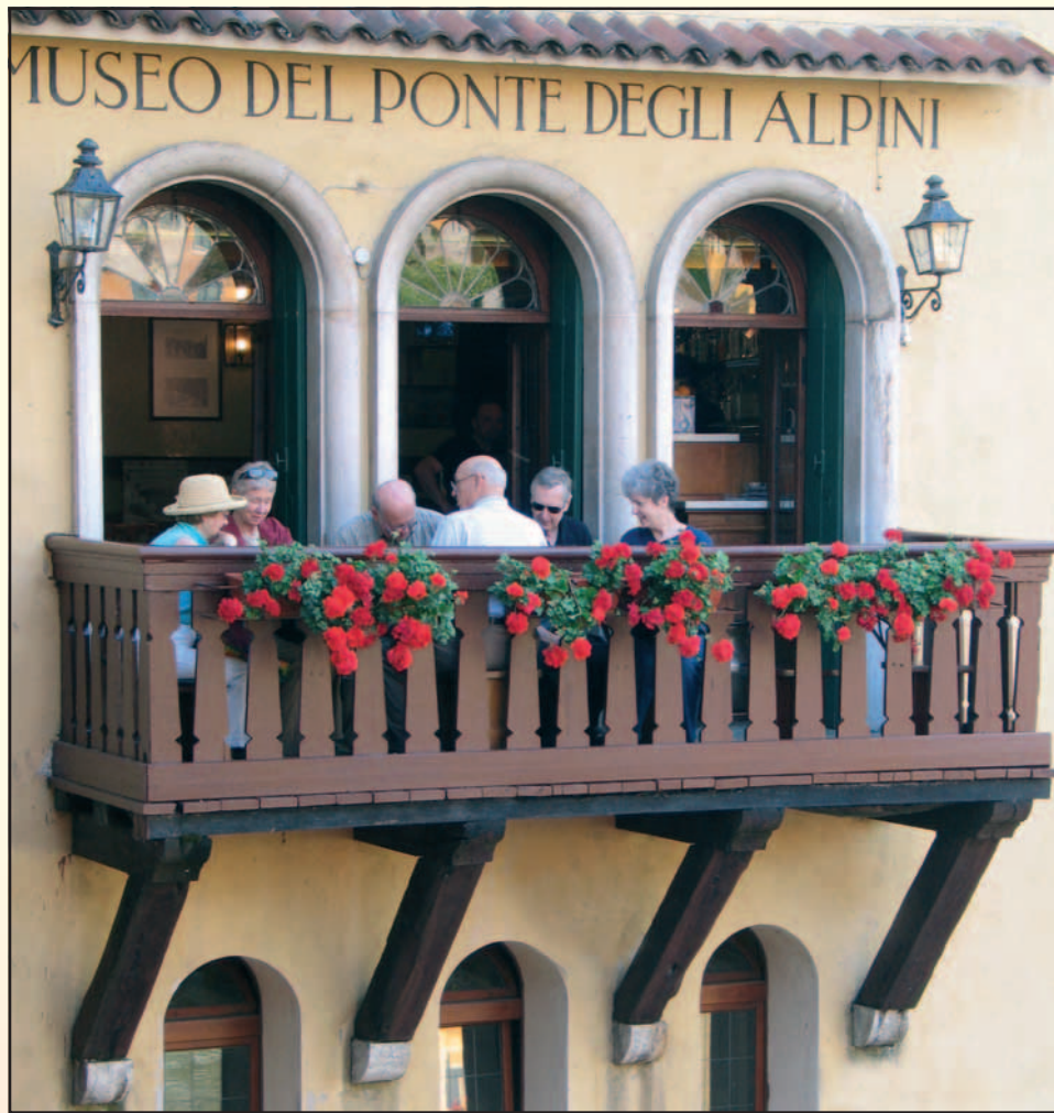
(Above) View of the balcony above the museum.