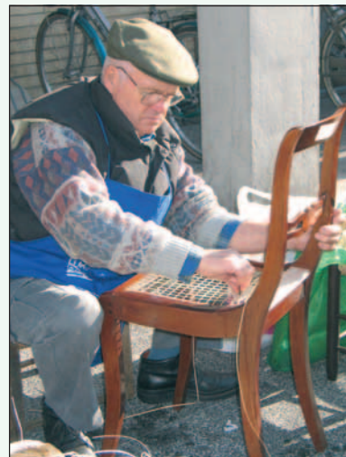
(Above) A craftsman weaves the seat on a chair during a day of the market in downtown Bassano.

The museum's distinctive entrance is from the Taverna , tavern, whose flowered balcony overhangs the river and it is located in a below-ground two-floor setting whose windows look toward the trapezoid wooden piers of the bridge. Several historical documents, photos and items referred to the Alpine corps and the events that occurred during the wars are on display. In the lower floor there is also the reconstruction of a trincea , or trench. It is open daily - except on Mondays - from 9 a.m.-8 p.m. Entrance is free, but donations are accepted for postcards that are displayed near the guest registry.