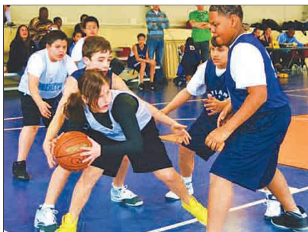
Taking shots: Above, players on a Vicenza Bantam team in the Child and Youth School Services Basketball League play against Aviano Saturday at the Pavilion. Right, the Suns take on the Spurs.