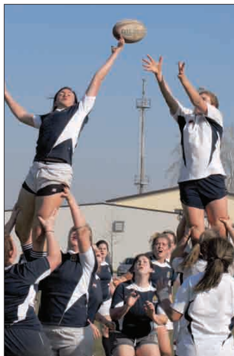
Players employ a lineout during a game Sunday.

Players on the team come from all over the U.S. and have varying backgrounds from high school standouts to first time