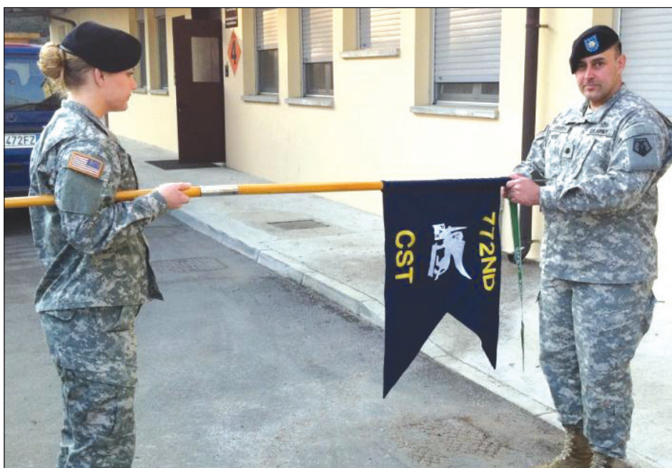
Safety accolades: The 772nd Civil Support Team, 209th Army Liaison Team, 7th Civil Support Command, was awarded the Army Safety Excellence Streamer Feb. 5 in Longare for 12 consecutive months without any loss of Soldiers or equipment from Oct. 1, 2009, to Sept. 30, 2010. The 772nd CST surpassed the 98 percent requirement for 24 months in Composite Risk Management training.