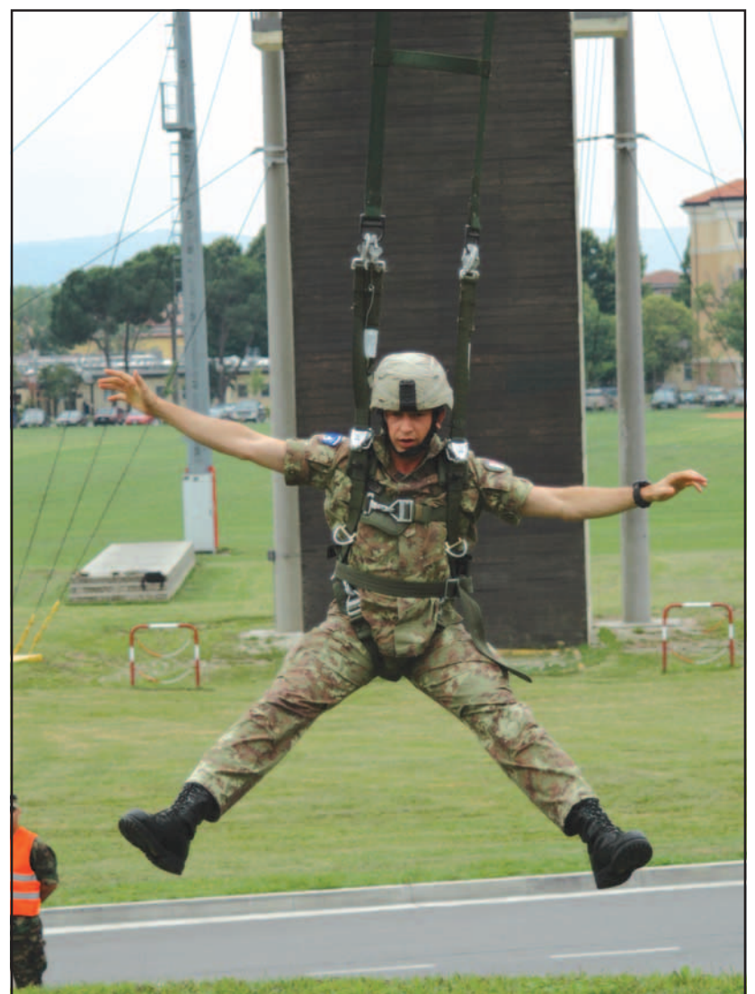
One Alpini soldier comes in for a landing after jumping from the 34ft jump tower out on the North 40.

The week of classes concluded with live-fire qualification training at Cao Malnisio , a military range near Aviano.