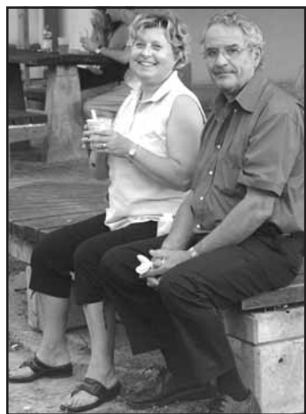
A couple enjoy a dish of ice cream during a previous July 4 celebration on post.

skates, skate boards, heeies, bicycles, mopeds or pets allowed in the fest area.