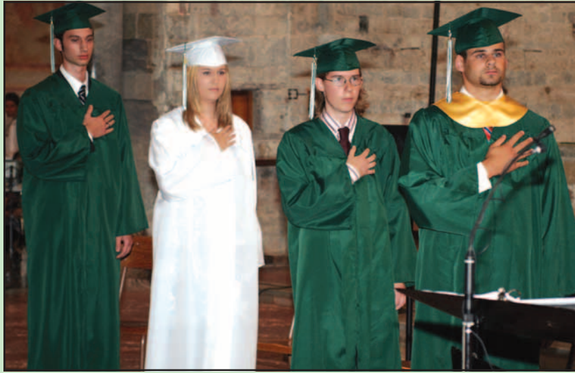
(Left to Right) The final students to graduate from Livorno High School attend the graduation ceremony.