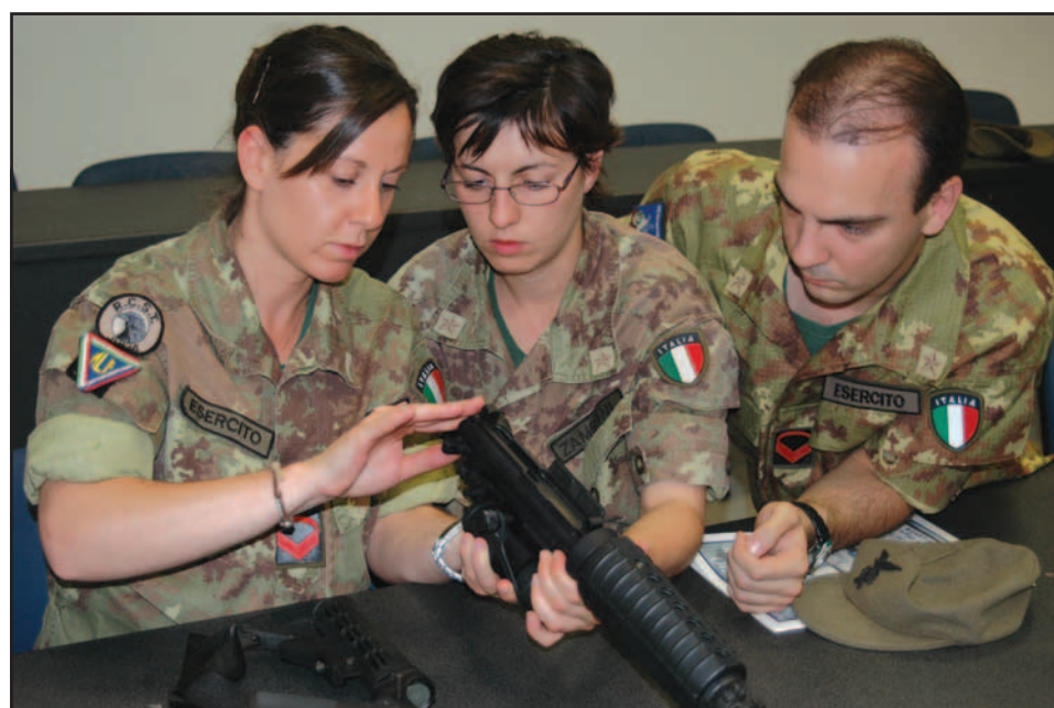
(Left) The Alpini soldiers practice replacing the bolt of the M-4 during their basic marksmanship instruction course May 4. Eight Italian soldiers from Commando Truppe Alpine received training from members of the U.S. Air Force Weather Service on weather forecasting, equipment and basic Soldiering skills on Caserma Ederle May 4-8.