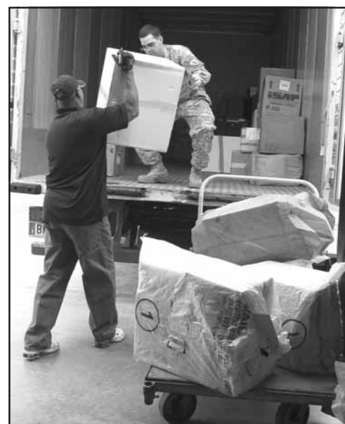
Army Post Office workers load packages onto a truck bound for the airport.

will not go out until the following day and the cut-off for Registered or Express mail items is also 4 p.m.