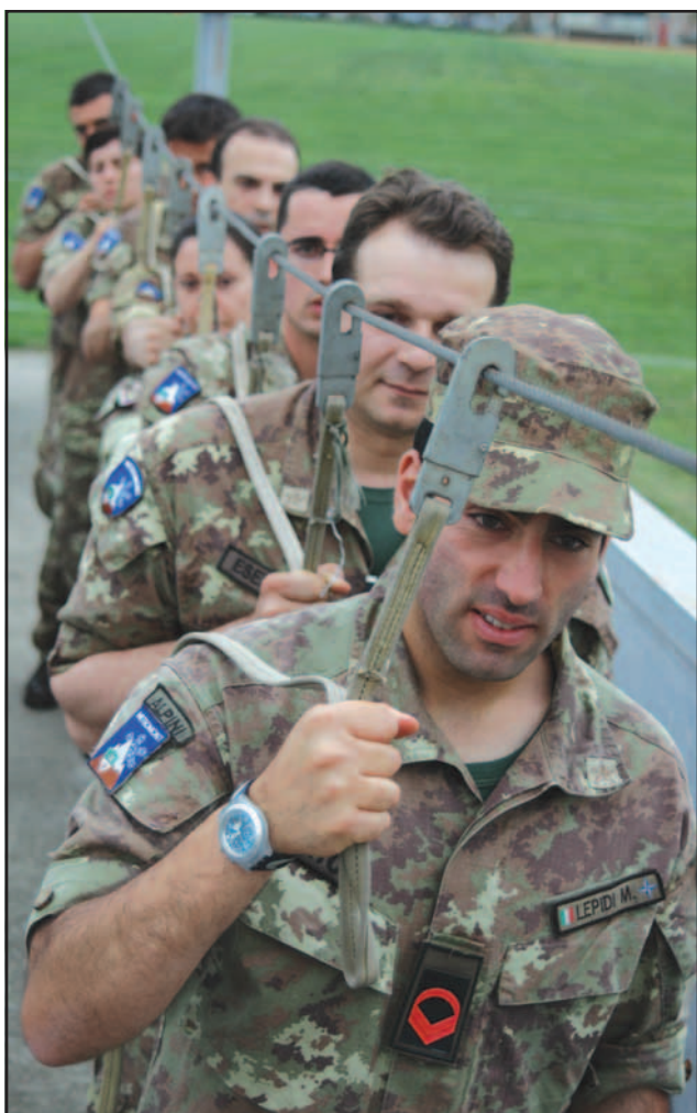
The eight Alpini soldiers stand in line waiting for instruction from the jump master's during ground jump training on Caserma Ederle's North 40 in May.