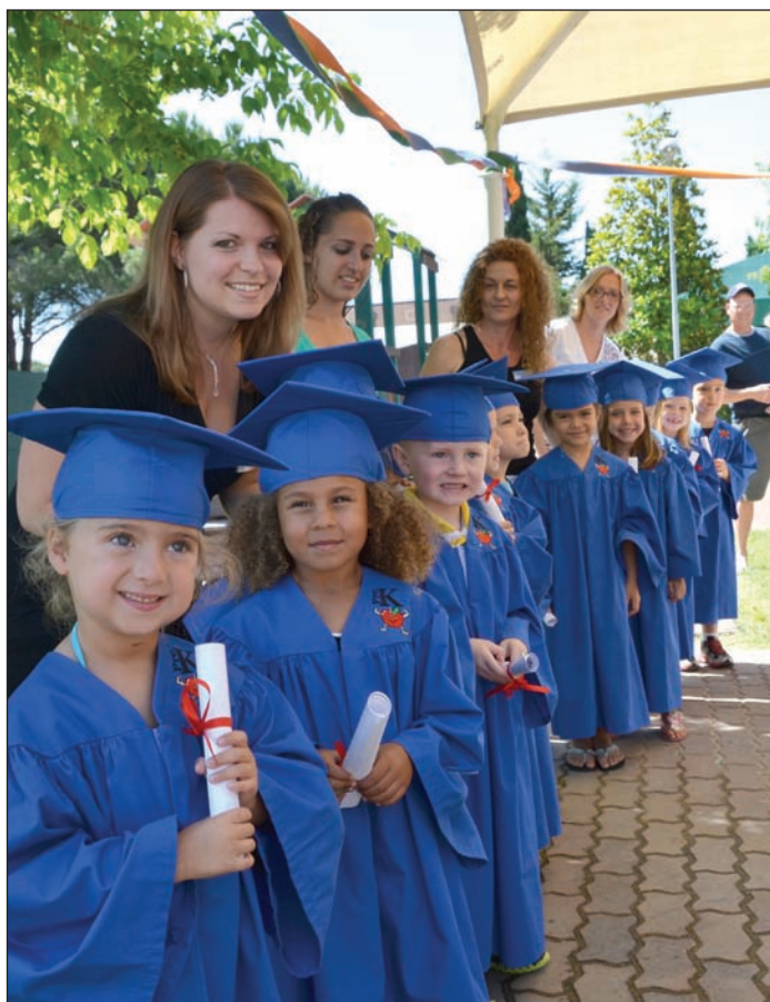
Children are presented graduation certificates from Strong Beginnings June 15 at Camp Darby Child Development Center.