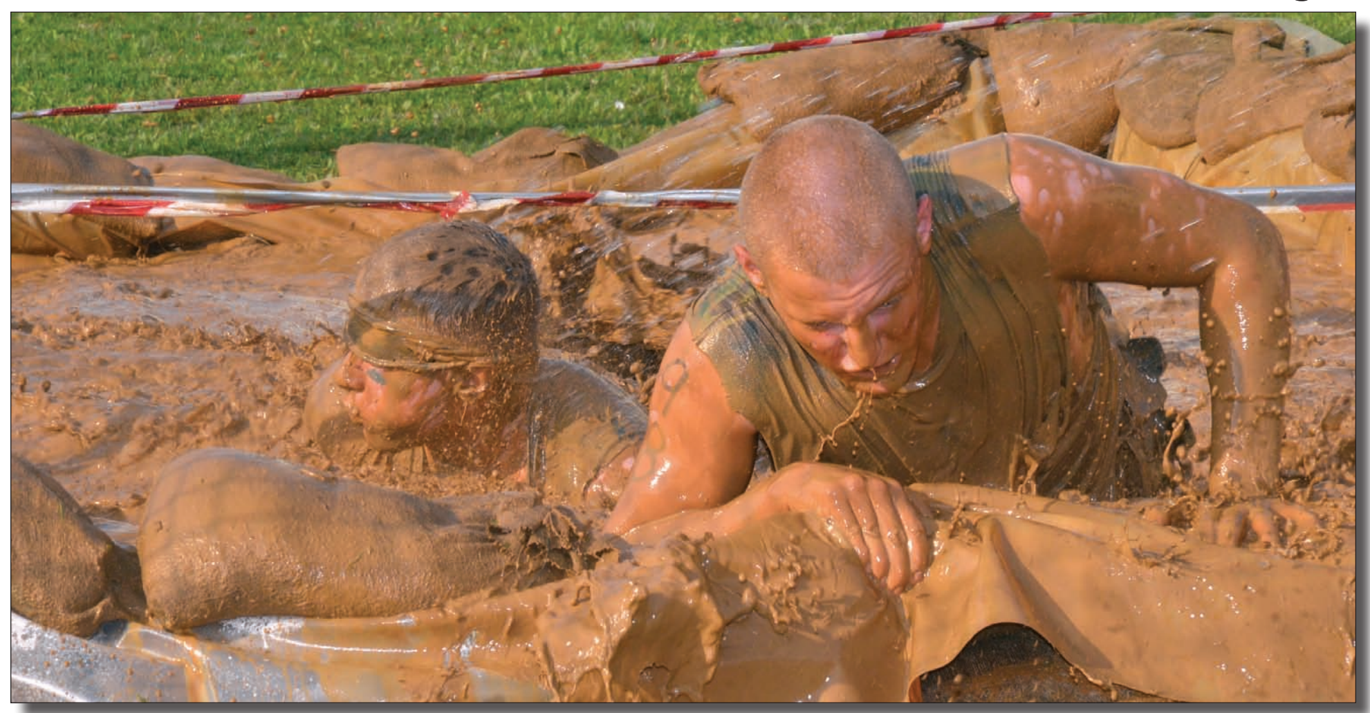
Participants in the Warrior Challenge II attempt to emerge from the mud pit, one of the many obstacles of the five-kilometer run held Friday on Caserma Ederle.