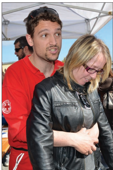
Italian Red Cross member teaches Heimlich May 10 at Safety Day.

Learn more about Summer Safety by visiting www.usag.livorno.army.mil .