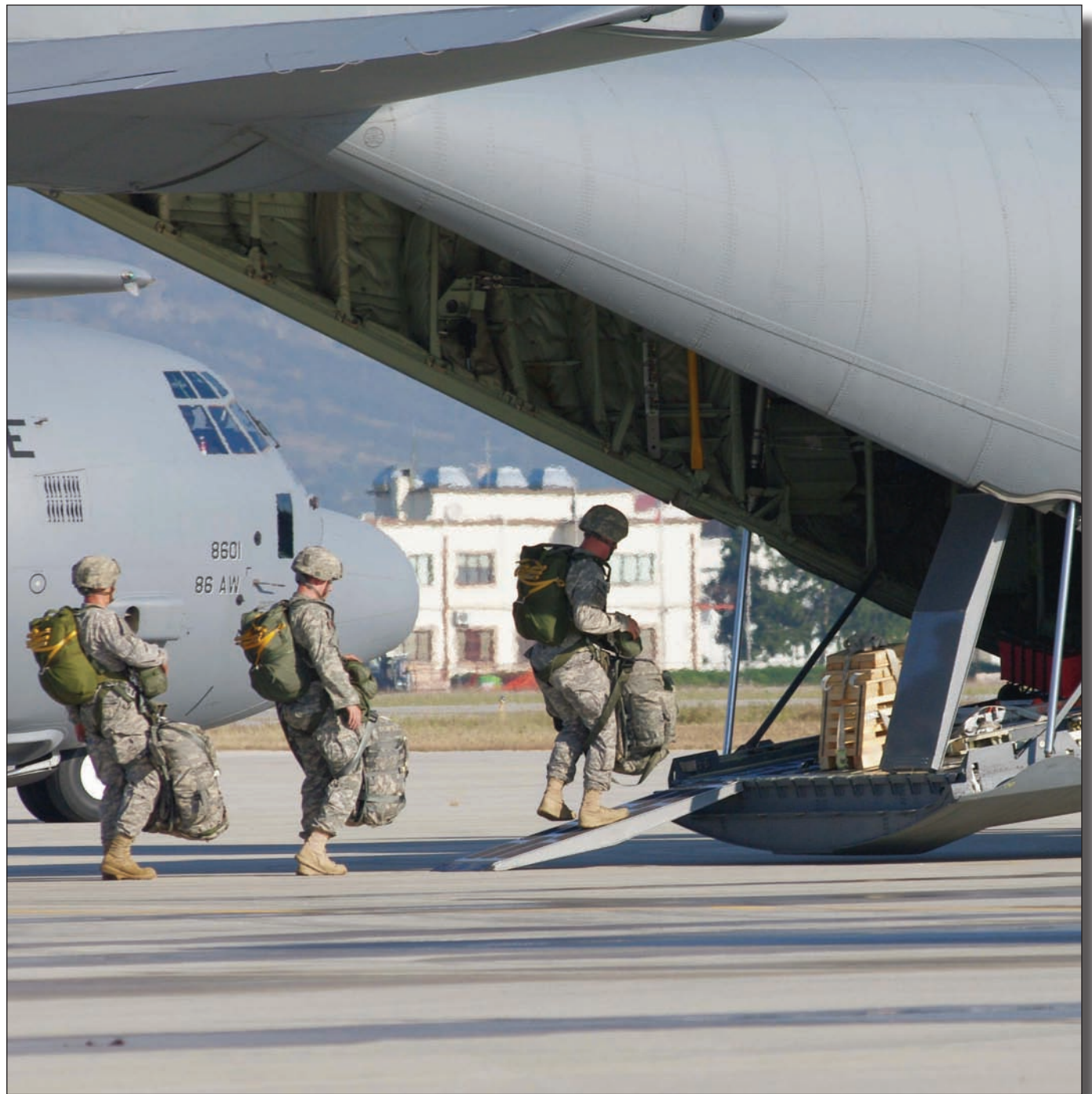
173rd ABCT photo

The DPTMS is responsible for gathering the contents about the deployment and redeployment efforts around the local