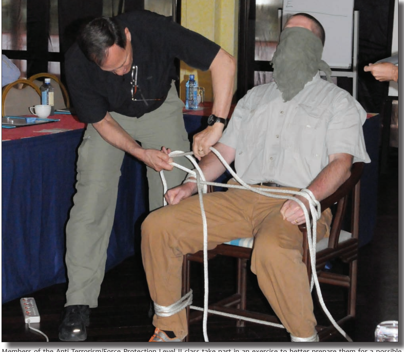
Members of the Anti Terrorism/Force Protection Level II class take part in an exercise to better prepare them for a possible abduction or hostage situation.

Training consisted of students from different areas of operation and job fields from all over the continent. Personnel who have had years of experience in AT/FP traded ideas and shared their experiences with those whose only experience with AT/FP was the required