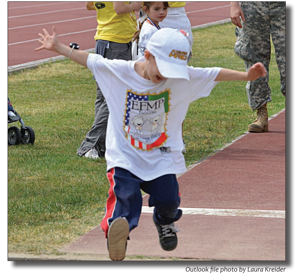
A participant in the Exceptional Family Member Program jumps during last year's competition.

Currently, the EFMP hosts weekly athletic skill-building classes and activities that rotate monthly. These include sports such as basketball, volleyball, or soccer, dance, yoga plus beginner and intermediate swimming classes. The basic fundamentals are presented in a fun way that includes more visual and auditory instructions that you