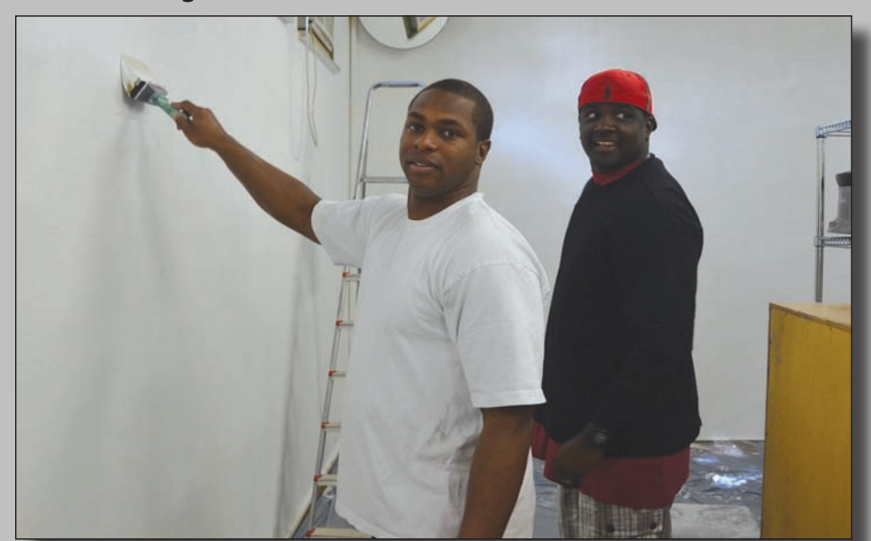
Above and below, 839th Trans. Bn. Soldiers help give the thrift shop a facelift.