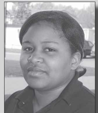
Ariana Pope Arena

"I like the 'Twilight Saga' 'True Blood' and anything by Nicholas Sparks."