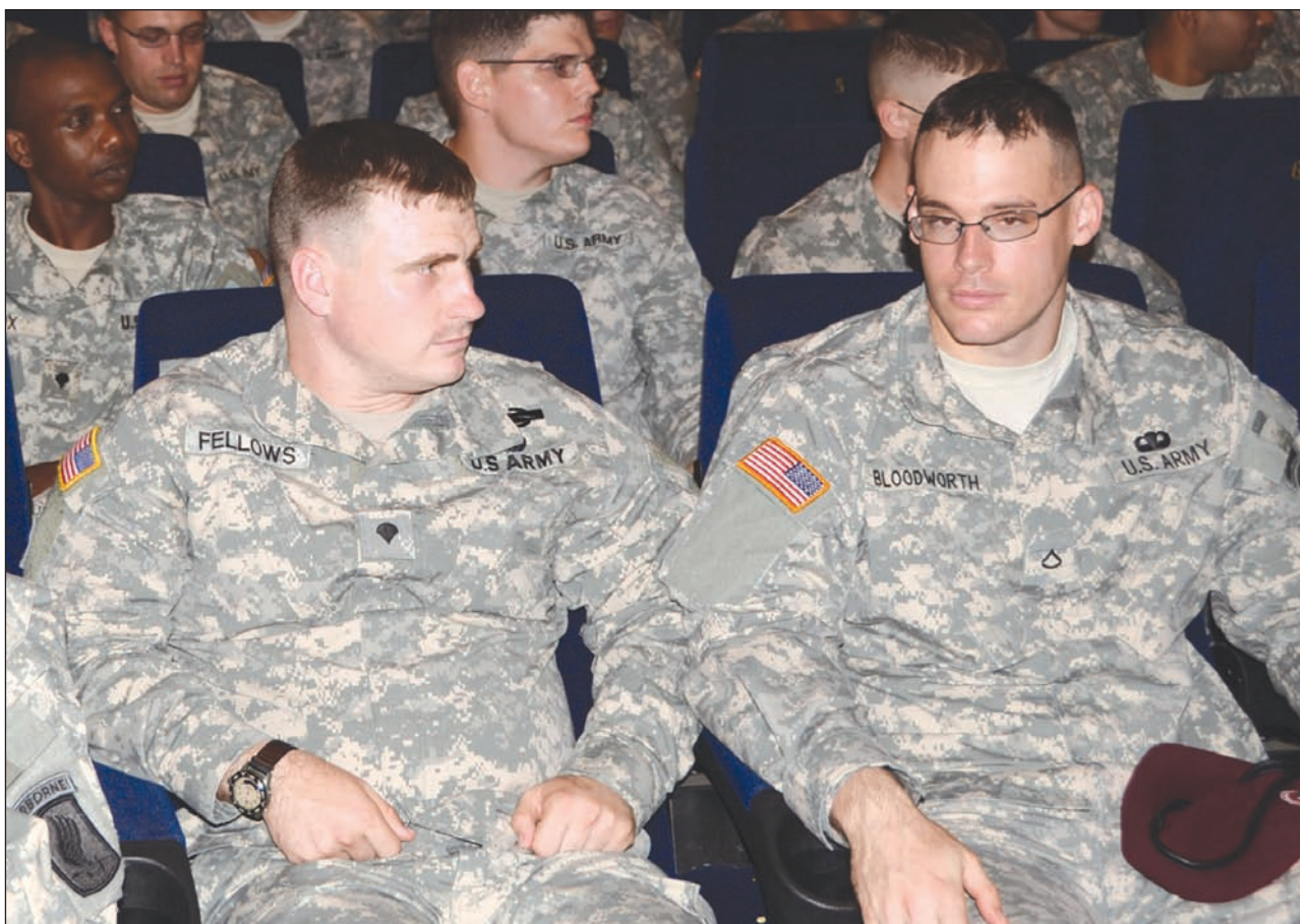
Soldiers from the 2nd Battalion, 503rd Infantry Regiment, 173rd Airborne Brigade Combat Team, listen to a brief on the Total Army Sponsorship Program at the post theater Aug. 22. The new program places emphasis on assisting Soldiers and Family members with their new duty station.