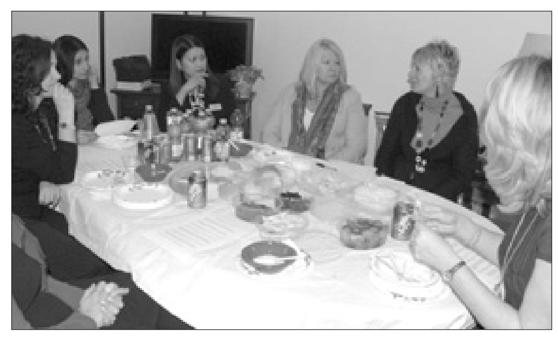
Local survivor spouses gather at a Survivor Outreach Services support group Dec. 15.