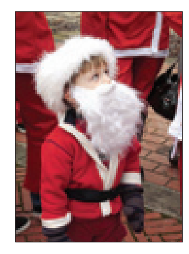
A perspective on changing eating habits; USAHC participates in Santa Run