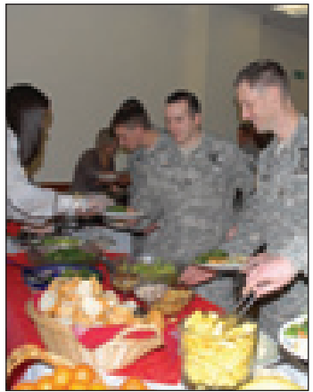
New IMCOM CG offers holiday message; ACS brings community aid