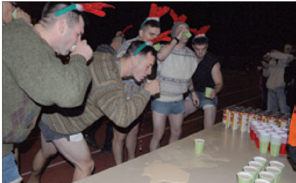
Team Chosen Few chugs down a cup of egg nog before beginning a run during the Reindeer Games Dec. 2.