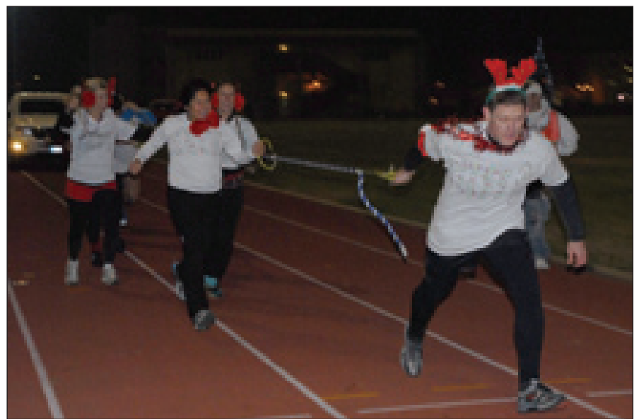
Above, The Crazy Eights, who won the Best Dressed award, help each other over a hay bale during the Reindeer Games. Below, Team Muffs and Mitts pull Santa's Sleigh, otherwise known as a truck, across the finish line.