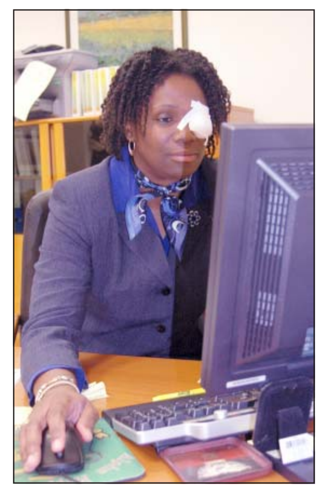
A USAG Vicenza staffer, simulates a visual disability while working at her computer at the Analysis and Integration Office during a disabilities awareness event, Oct. 20. Volunteers from different offices simulated disabilities such as visual, hearing and mobility impairments during their regular work duties for three hours.