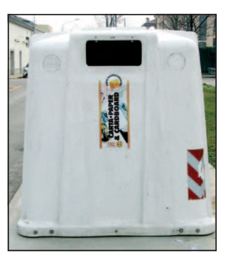
Paper Products & Small Cardboard Paper and small cardboard must be flattened and placed into the white cubical containers. Only paper bags may be placed in the containers. No plastic.