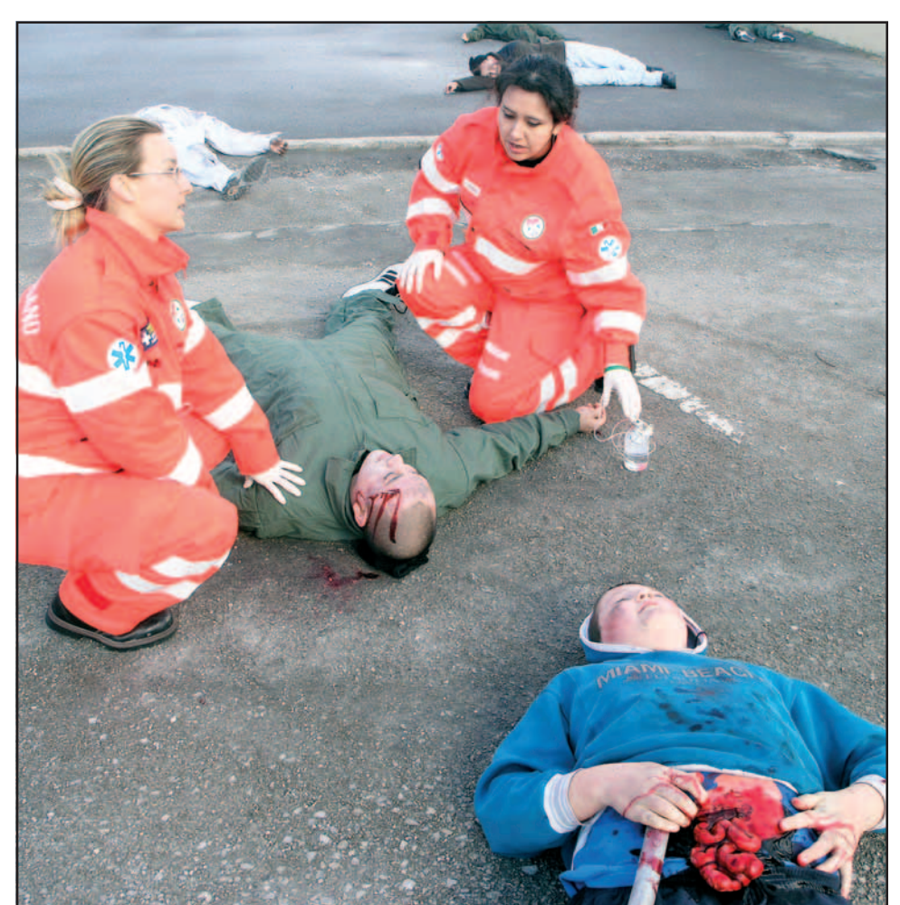
Members of the Italian 118 first medical emergency service are the first to arrive on the explosion site, and they are responsible for a first evaluation of the victims and to organize the triage.

Soldiers of the 497th Movement Control Team prepare to leave Camp Darby March 6 for a yearlong deployment to Afghanistan. The 497th MCT will be supporting Operation Enduring Freedom. While most of the young Soldiers are on their first deployment, some 497th Soldiers have already been deployed to Afghanistan and Iraq.