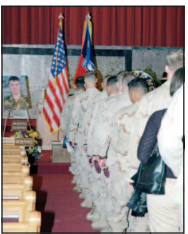
Fellow Soldiers and community members line up to pay their final respects following the memorial ceremony.

Bordelean recalled memorable moments shared between the two