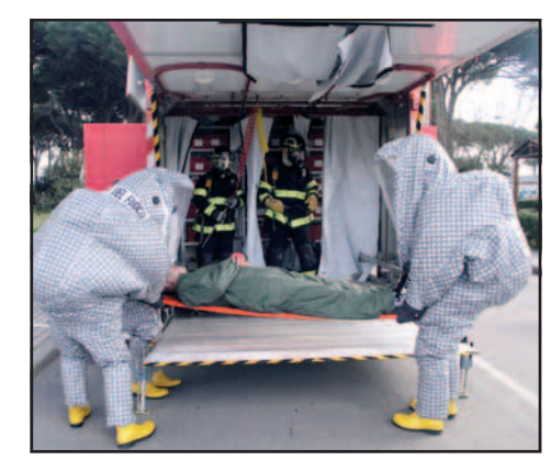
Italian Firefighters from Pisa Fire Department (in grey) bring a contaminated person to the Camp Darby Fire Department truck equipped with decontamination showers.

The exercise proved valid, according to Snyder. "There are still some aspects we have to work out in order to do better, but the participation of the community, as well as that of the local agencies, was tremendous."