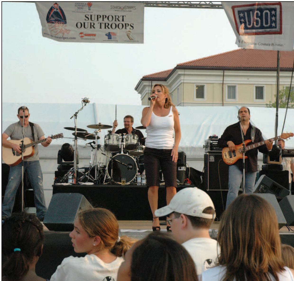
Top Right: Country singer, Lee Ann Womack kicked off the evening's entertainment. Womack took to the stage for an hour and sang her chart-busting hits for the enthusiastic crowd.