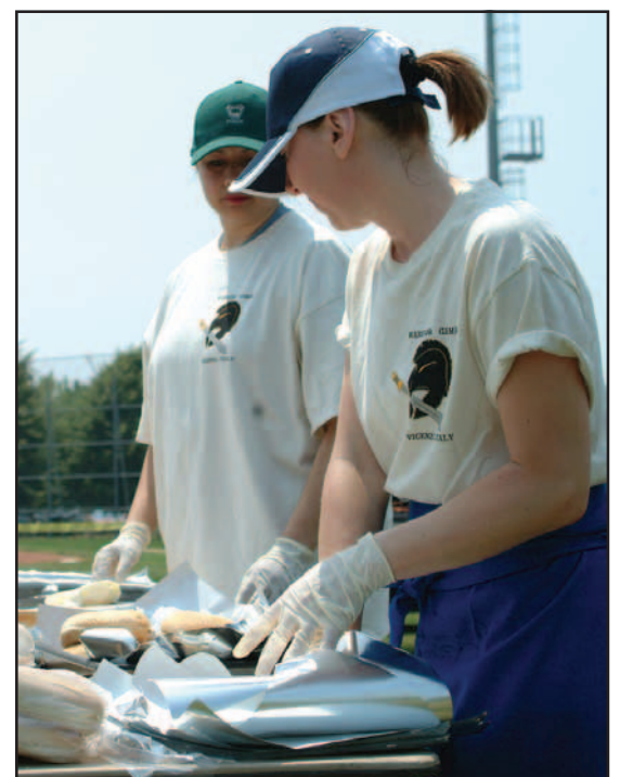
Workers prepare hamburgers for the HomeFront celebration held Wednesday on the North 40. The women were two of more than 50 community members who spent hours cooking to ensure the food line never ran out.

I thank them for coming and I also thank USAREUR and IMA-Europe for the support in assisting with getting these top-notch