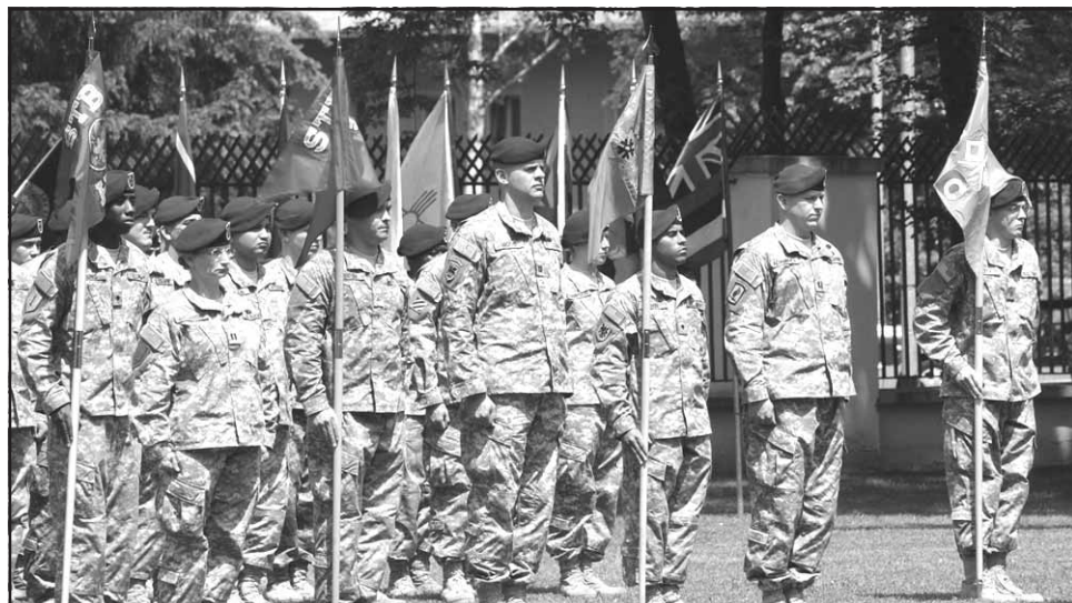
Soldiers of the new 173d Airborne Brigade's Special Troops Battalion display their guidons after its activation at Warner Barracks in Bamberg, Germany, June 8. The event was part of a larger ceremony in which 1st Battalion, 33d Artillery Regiment re-designated to the 4th Battalion, 319th Field Artillery Regiment.