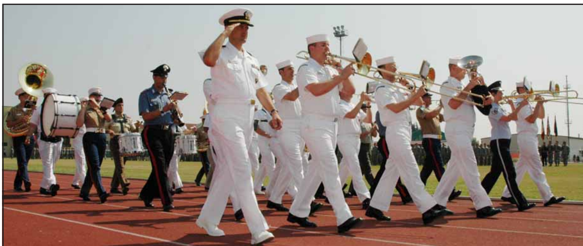
The Allied Forces South Band from Naples, Italy, performs for the crowd during the HomeFront celebration event held Wednesday on the North 40. The band also performed the night before at the Warrior's Feast and gave a free performance in Piazza dei Signori in downtown Vicenza Thursday night.

performers to play for us and so much more. Last, but not least, I thank all those involved in providing increased security services for the week's events: Office of the Provost Marshal, the Caserma Ederle firefighters, 13th Military Police Company, and our local Carabinieri.