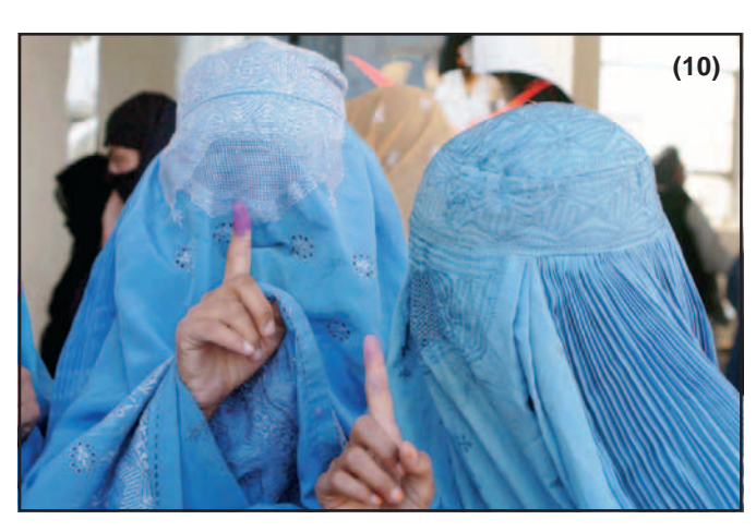
A Look Back from Page 1

ot only DPW has been involved in growth and transformation. Here are some other changes that have taken place during 2005: