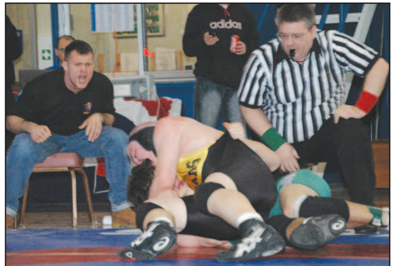
Top: A Vicenza High School wrestler goes for the pin against one from Naples in the 215 lb weight class.

The same positive outlook about the Vicenza