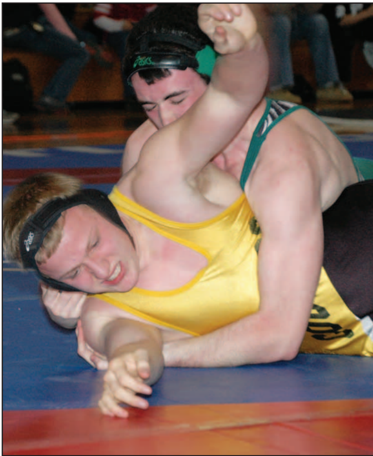
A VHS wrestler one of the Naples Wildcats in the 189 lb weight class.

A total of 64 high school wrestlers competed this Saturday in the DoDDS Southern European Sectionals held at the Vicenza Fitness Center.