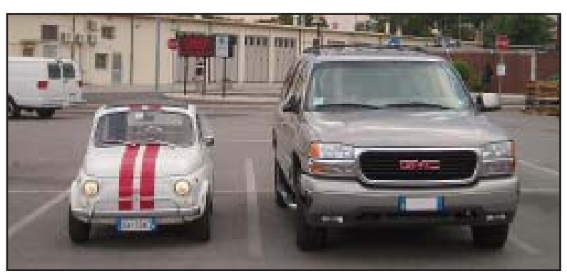
The author's FIAT 500 may not match this GMC in size...but when it comes to parking, gas comsumption, and driving fun... people understand why it was (and remains) so popular.

As this engine, which only provided 13 horsepower, was considered too weak by many contemporaries, the later 500s (F, L, and R models) sported a proud performance of up to 22 horsepower.