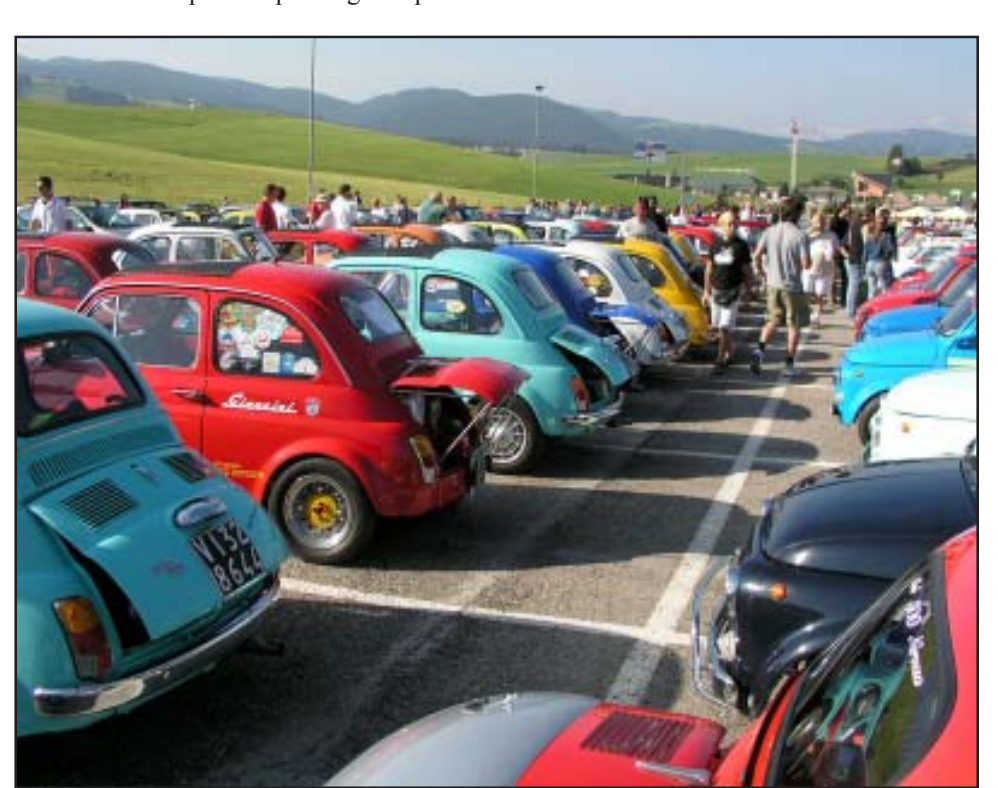
Every year up in the hills around Asiago, just 30 minutes north of Vicenza, is a Raduno Cinquecento (Fiat 500 Rally) which is one of many held in the Veneto region, and this year it is scheduled for Sept. 3-4.

One of the highlights of the events (even from e spectator's perspective) is a tour of all of these cars through the seven villages of Asiago, which cover approximately 25 km of paved mountain roads...quite a sight, indeed.