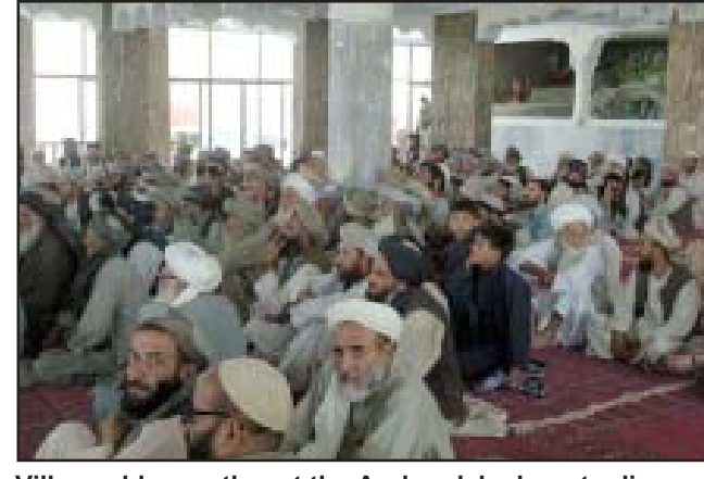
Village elders gather at the Arghandab shura to discuss issues including opium and illicit drug crops, as well as security.