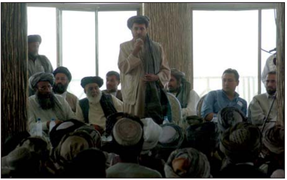
Kandahar Gov. Assadullah lets the attendees know that proud he is of the people of Arghandab and their distinguished history as defenders of Afghanistan.

The governor mentioned that electricity projects would increase in proportion with the security in the areas where the electricity was needed.