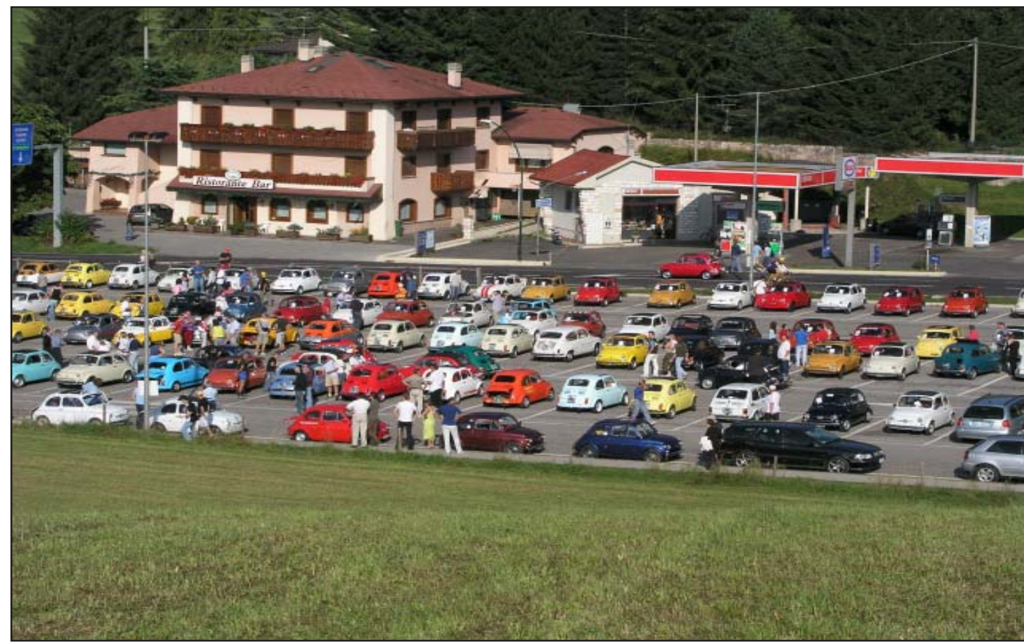
FIAT 500 lovers from all over Europe compare cars and stories about these immensely popular little car. As part of the FIAT 500 Rally, the vehicles all participate in a 25 kilometer ride throught the the seven cities of Asiago area.

Built between 1957 and 1975 and available in various body styles, the 500 features a layout similar to that of the VW Beetle based on a rear-mounted engine. The FIAT 500 is equipped with an air-cooled 500cc (30 cubic inches) 2-cylinder motor and backed up by 13 to 22 wild Italian cavallinos (horsepower). A 500 will catapult its passengers up to a