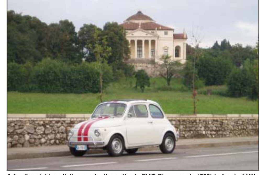
A familar sight on Italian roads, the author's FIAT Cinquecento (500) in front of Villa Rotonda in Vicenza.

This model distinguished itself as a citycar, and became very popular because of its small size, four passenger capacity and low gas consumption.