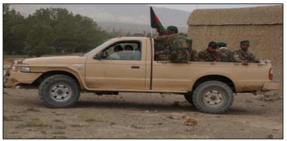
A squad of Afghan National Army soldiers follow an NAI patrol through the area surrounding Forward Operating Base Harriman July 27.