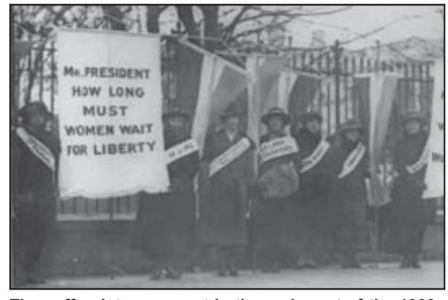
The suffragist movement in the early part of the 1900s was the driving force behind the writing of the 19th Amendment to the U.S. Constitution.

During this time there were 56 referenda to male voters, 480 efforts to get state legislators to submit suffrage amendments, 277 campaigns to get state party conventions to include woman suffrage planks, 47 campaigns to get state constitutional conventions to write woman suffrage into state