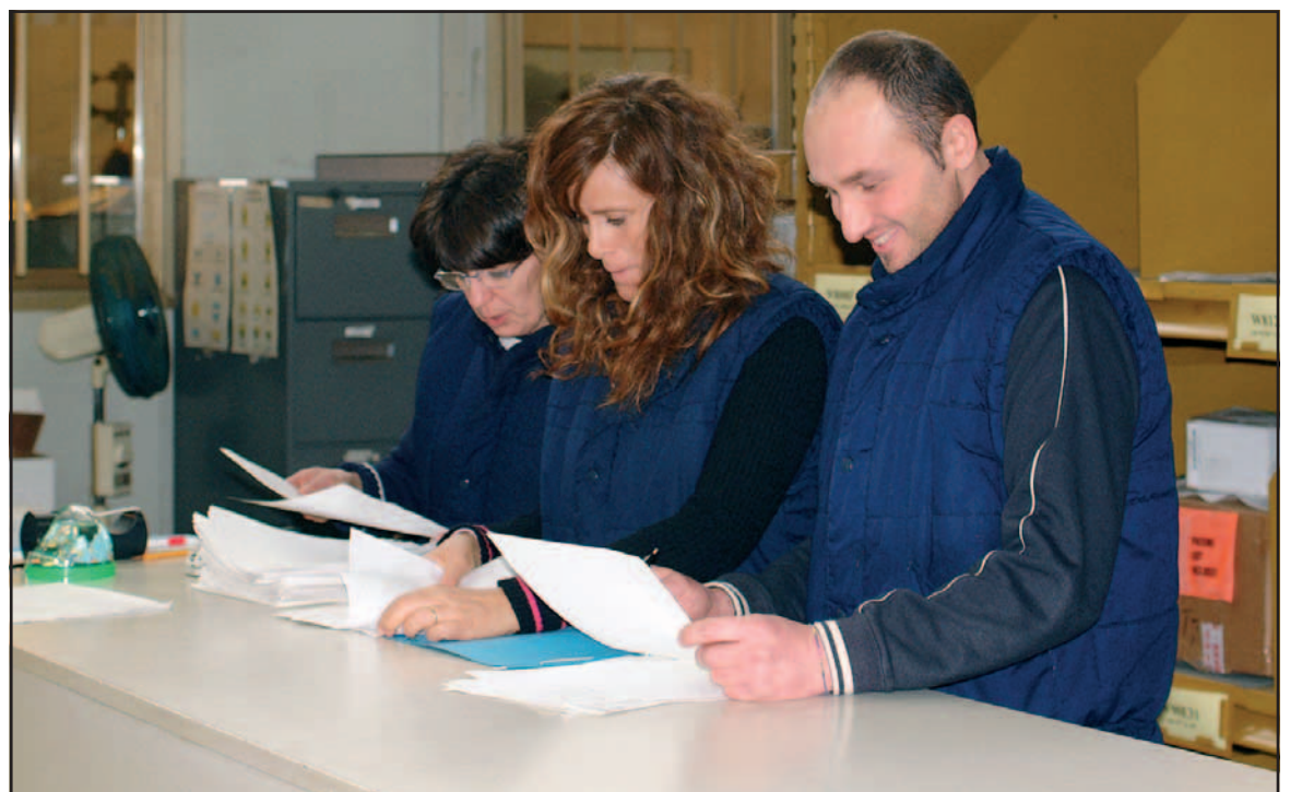
Italian employees who maintain all aspects of the warehouse, from ensuring all the required paperwork is correct and processed (above) to performing customer service for the SSA. Left: Two more of the local national workers, use computers at the receiving point to update records. Even with the competition, SSA continues its regular mission, thanks largely in part to the local national workforce.

the military positions are converting over to civilian positions,” he said.