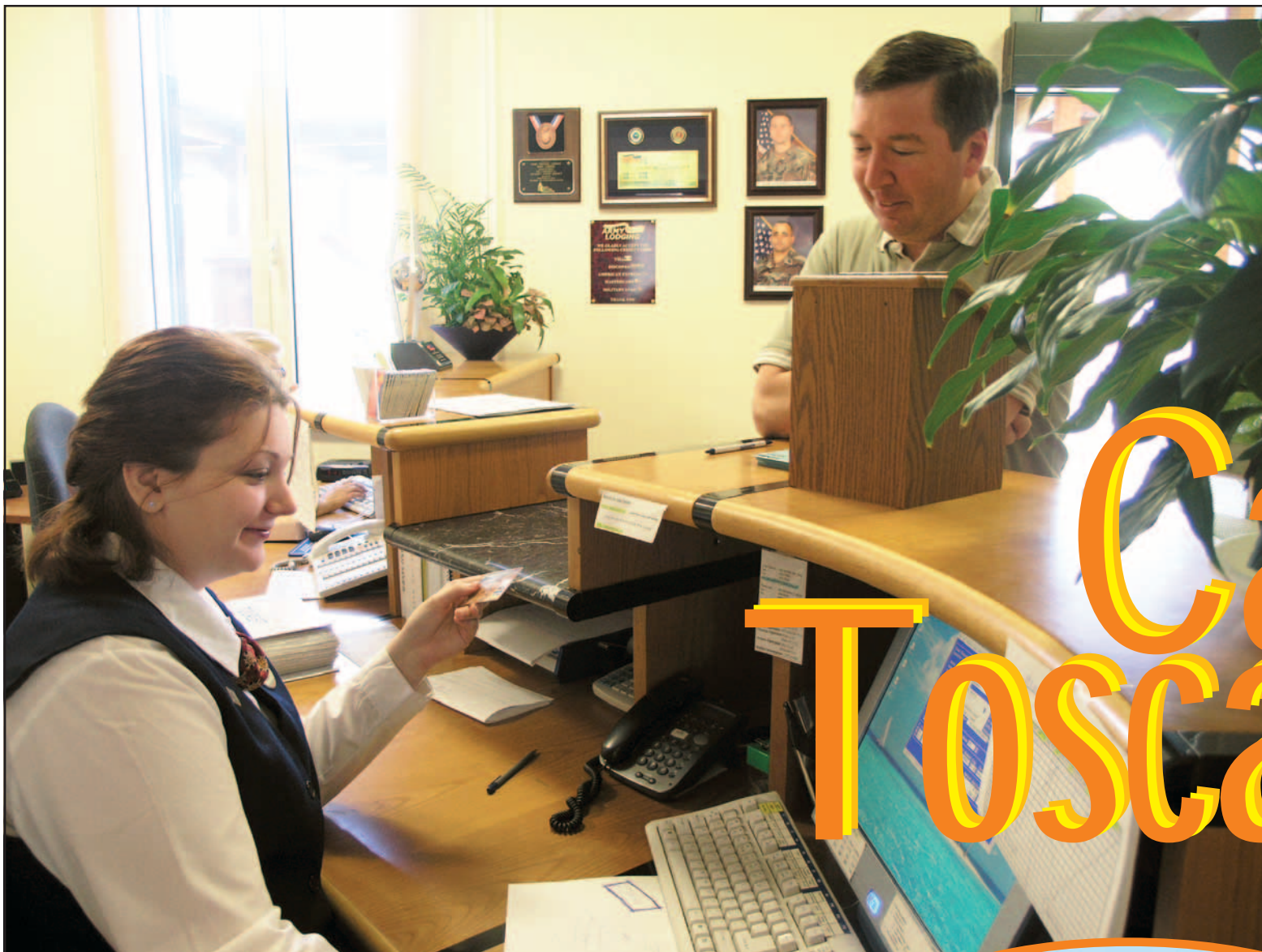
A Casa Toscana desk clerk assist a customer with his out processing procedures. Below: An outside view of Casa Toscana.