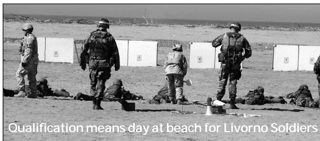
Qualification means day at beach for Livorno Soldiers

"People will suffer heavier penalties and can even lose their license if they caused an accident or were involved in one while using a cell phone improperly," Anderson added.