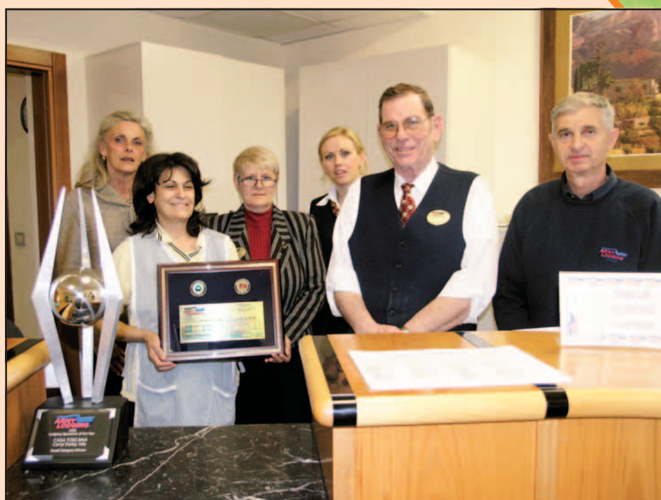
Above: The proud staff of the Livorno Army lodging won the small operations category of the Army Lodging Operation of the Year Award for 2006.