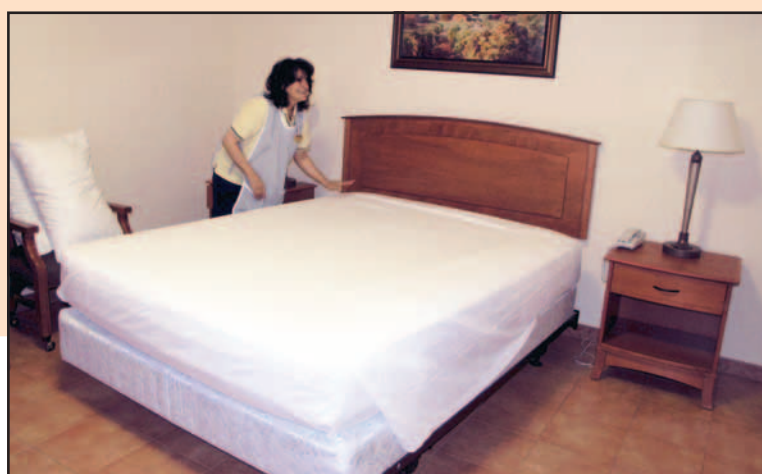
A custodial worker prepares a room upon a guest's departure.

For any information on Livorno lodging, call 633-7580 or commercial 050-54 75 80 or email at Casa.toscana@darby.setaf.army.mil