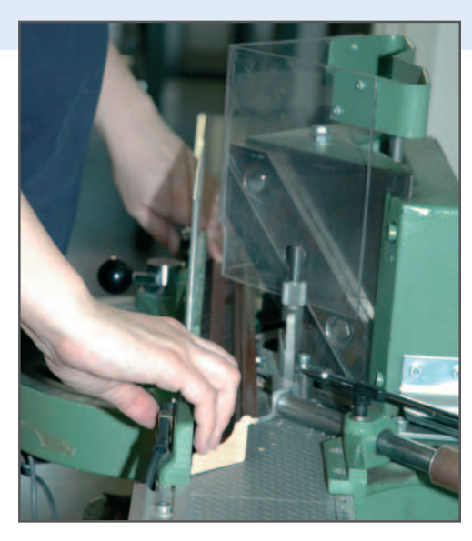
A family member works at the frame cutter.

Reintegration Framing Class April 13 – 4-8 p.m. Intro to Quilting II April 13 - 5:30-7:30 p.m. Mini Scrapbooks April 19 - 11 a.m.-1 p.m. April 20 - 5:30-7:30 p.m. Intro to Quilting III Reintegration Wood Certification April 21 – 4-6 p.m. Intro to Picture Framing April 22 - 1-5 p.m. April 27 – 5:30-7:30 p.m. Intro to Quilting IV