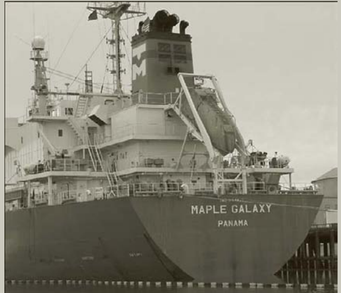
A T-1 class tanker like those the Defense Logistics Agency Pacific's plan manages effectively to save the Navy costs on Japan contingency plans.

By converting more than 4 million gallons of JP8 storage to JP5 storage at one of the DFSPs, the team was able to reduce the need for early T-1 deliveries and completely eliminate the need for the T-1 contingency contract.