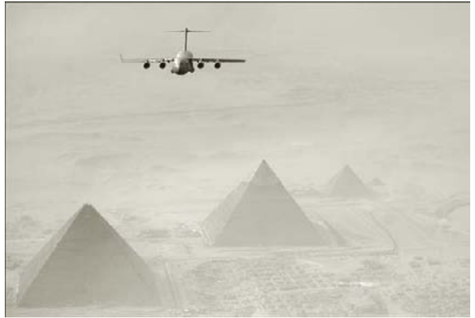
A U.S. Air Force C-17 Globemaster III aircraft flies over Cairo, Egypt, during Exercise Bright Star 2009. Bright Star, one of the exercises Defense Logistics Agency Central supports, is a joint international military airdrop exercise designed to strengthen and enhance cohesiveness of participating forces. The United States, Egypt, Kuwait, Pakistan, Germany and Jordan participated in 2009.

DLA Central has embedded more personnel with its customers in support of the recent surge in Afghanistan. Personnel support not only the daily warfighter requirements, but actively engage with customers in long-range planning efforts to identify future logistics requirements.