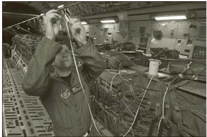
An airman prepares a cargo delivery system to drop supplies during Exercise Rim of the Pacific 2010, one of many exercises Defense Logistics Agency Pacific supports each year.

DLA Pacific Korea, a subordinate forward command, is the hub of logistics support for the Korean theater of operations. DLA Pacific Korea's commander and planning staff work closely with service logisticians to integrate DLA into planning and operations and, as needed, can form a full-scale DLA support team to assist in exercises or operations in Korea. Additionally, the DLA liaison officer to U.S. Forces Korea in Seoul directly interfaces with USFK and the 8th Army to address their strategic-level issues and ensure an in-depth understanding of DLA's capabilities. Warfighter service representatives are assigned throughout Korea to provide face-to-face support and training to their assigned customers with frequent on-site visits.