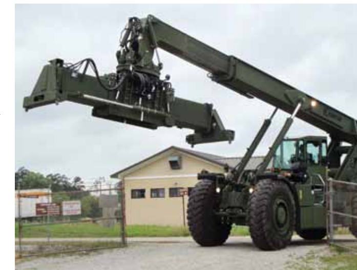
A mobile Kalmar container handler rolls onto the training site at Camp Shelby, Mississippi, during the practical exercise portion of redistribution property assistance team training.

The Army's Peacekeeping and Stability Operations Institute's Military Planning Handbook defines MARO as, "a contingency operation to halt the widespread and system-