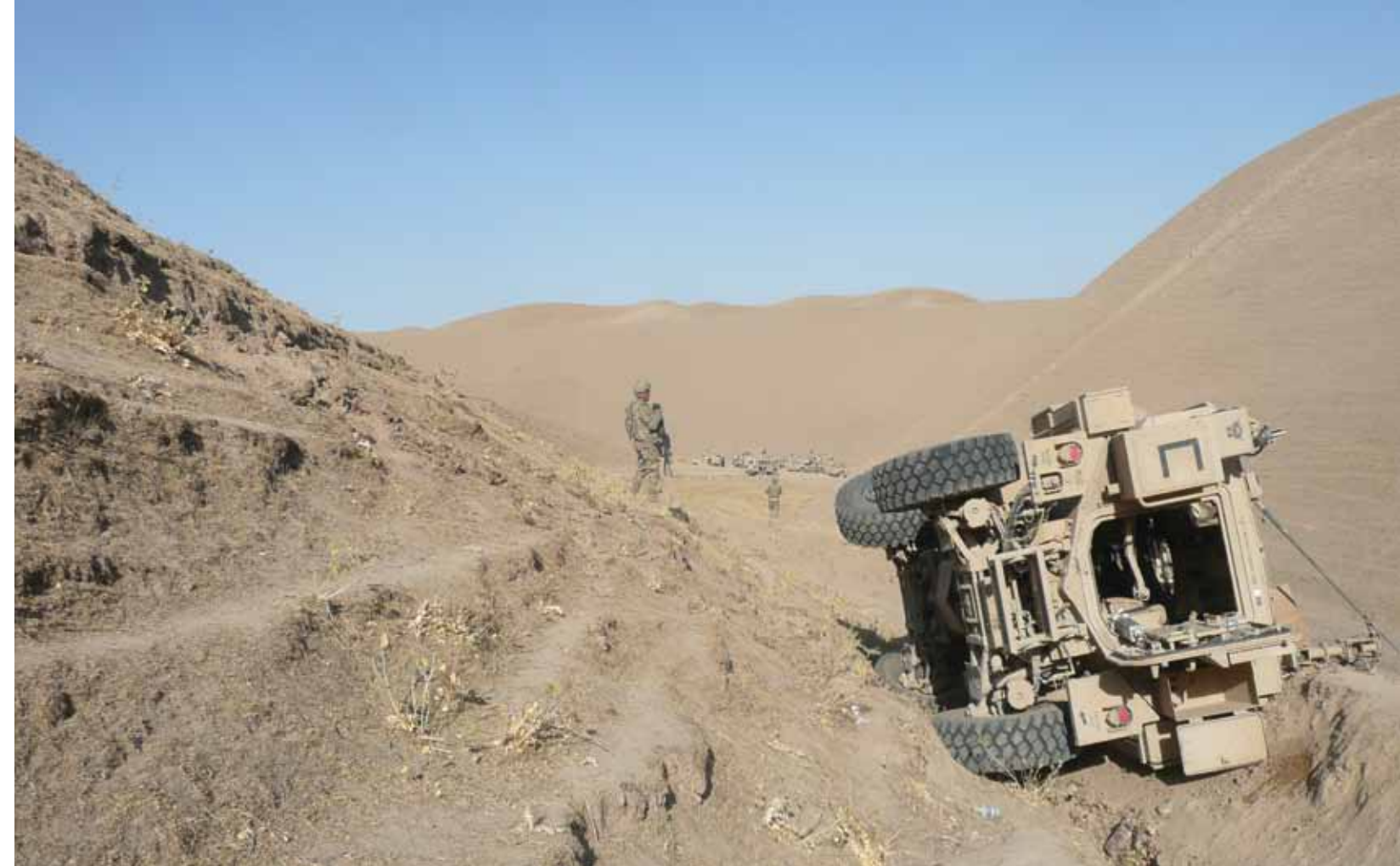
B Company's recovery team conducts an initial survey of the recovery site of a rolled RG-31 MRAP.

To meet this new demand, the Army and Marine Corps turned to industry to develop a solution. In the mean-