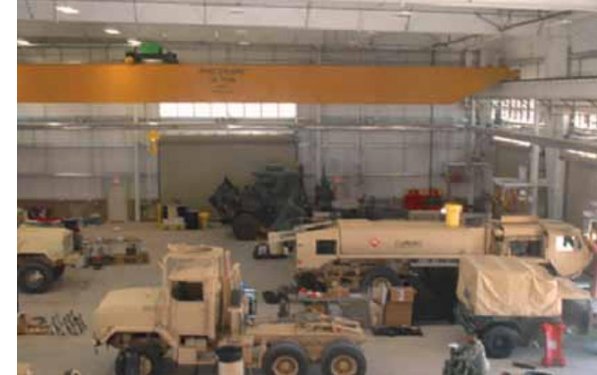
Soldiers at work in a medium brigade support battalion TEMF at Fort Bliss, Texas.

by adding information on how to use TEMFs and on the intended purpose of vital adjustments to TEMF standards and designs of the past.