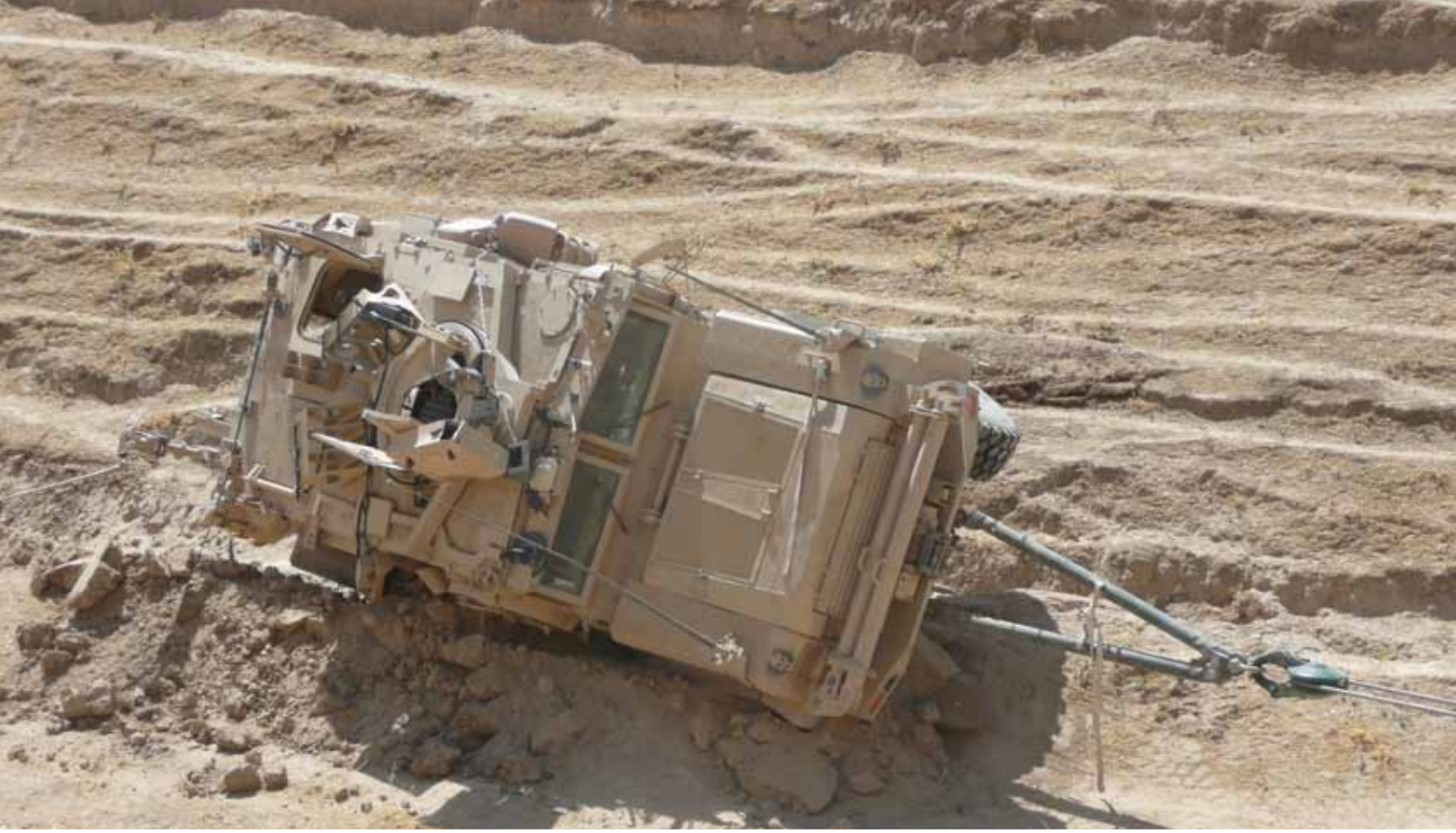
After hours of attempting more delicate procedures to remove the vehicle, the recovery team resorts to pulling the RG-31 from the ditch using a heavy expanded-mobility tactical truck's winch and a 60-ton snatch block.

vehicle, the M916. However, in practice, the M916 was not the problem; the MRV was. Struggling on many of the hills, the MRVs International DT engine showed its limitations. The vehicle also took a beating as it hit repeated dips and potholes, bottoming out numerous times. The crew described the ride as being somewhat reminiscent of a boxing match—they just kept taking hits. It all nearly came to a dramatic halt when the MRV failed five times to surmount a steep hill. Finally, after a running start, the MRV cleared the crest and rocketed over the far side. The mission continued.