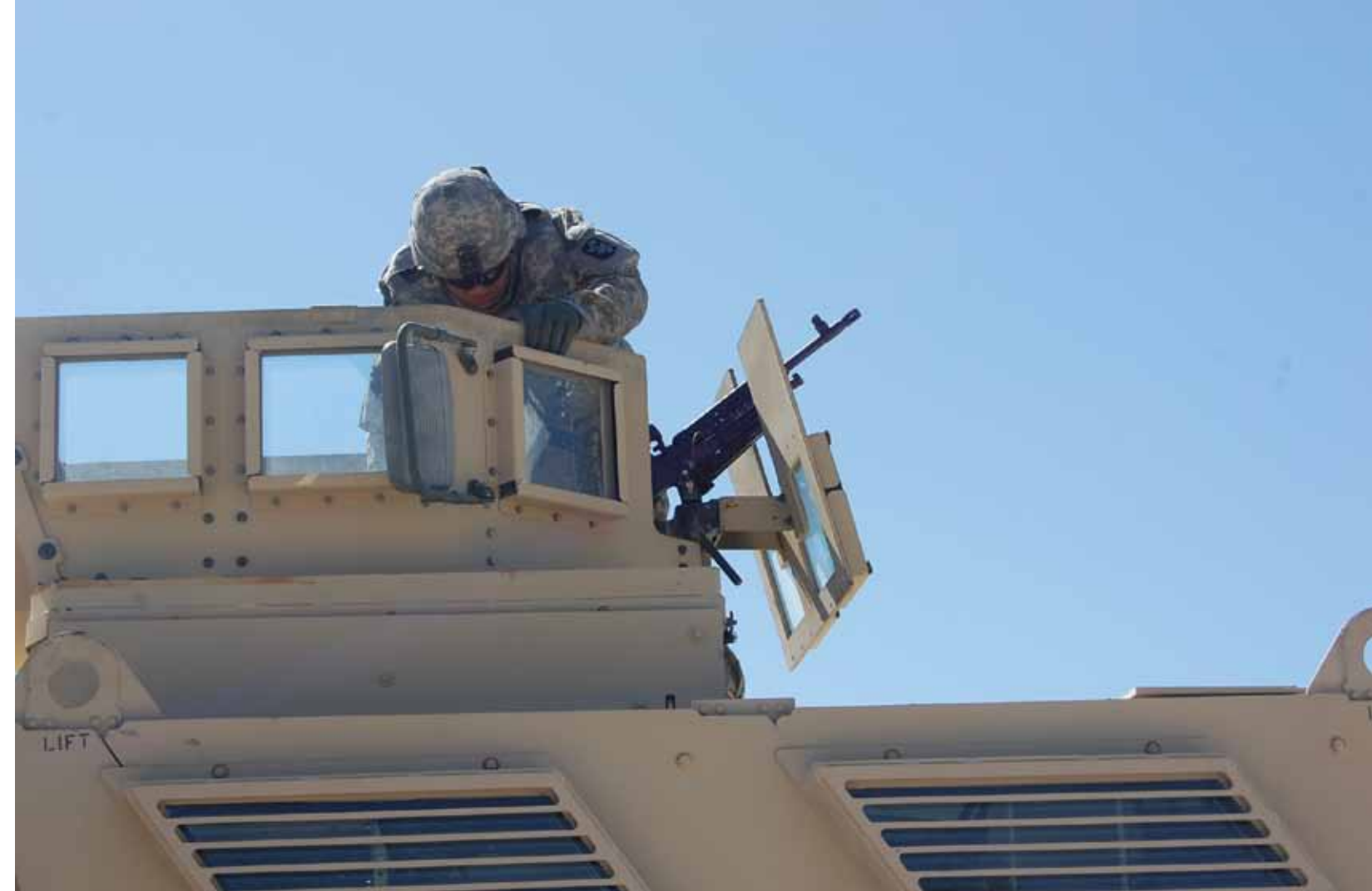
A Soldier prepares a vehicle for the gunnery range.

Once training on the basic Soldier skills of driving and shooting was completed, we began developing the crews’ ability to operate and communicate together