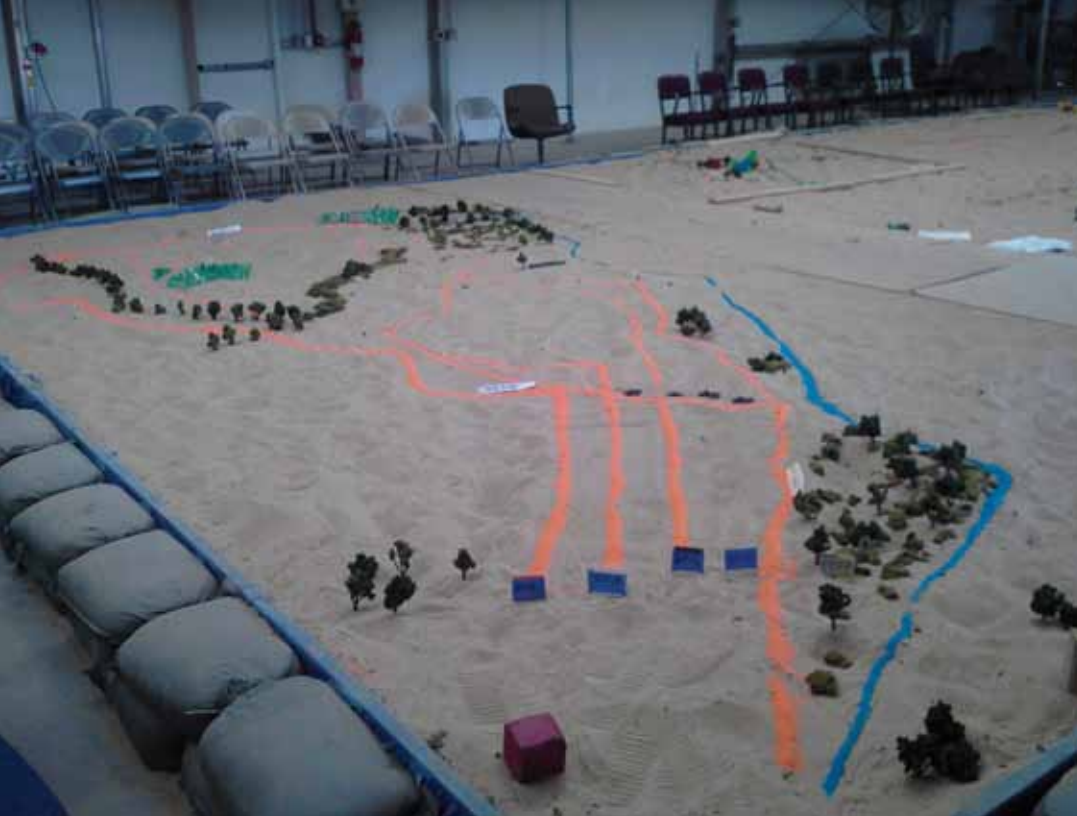
The 53d Quartermaster Company built a sandtable of the range in order to conduct a rehearsal of concept (ROC) drill with the battalion commander, the battalion S-3, and the vehicle crew evaluators. The ROC drill prepared the convoy escort teams to execute the final phase of gunnery operations.

into the final phase of gunnery operations, the completion of the sectional phase. Tables VIII and IX are meant to test each convoy escort team's ability to shoot, move, and communicate as a part of a convoy element. In order to accomplish this, we established five sections of four gun trucks each and moved out