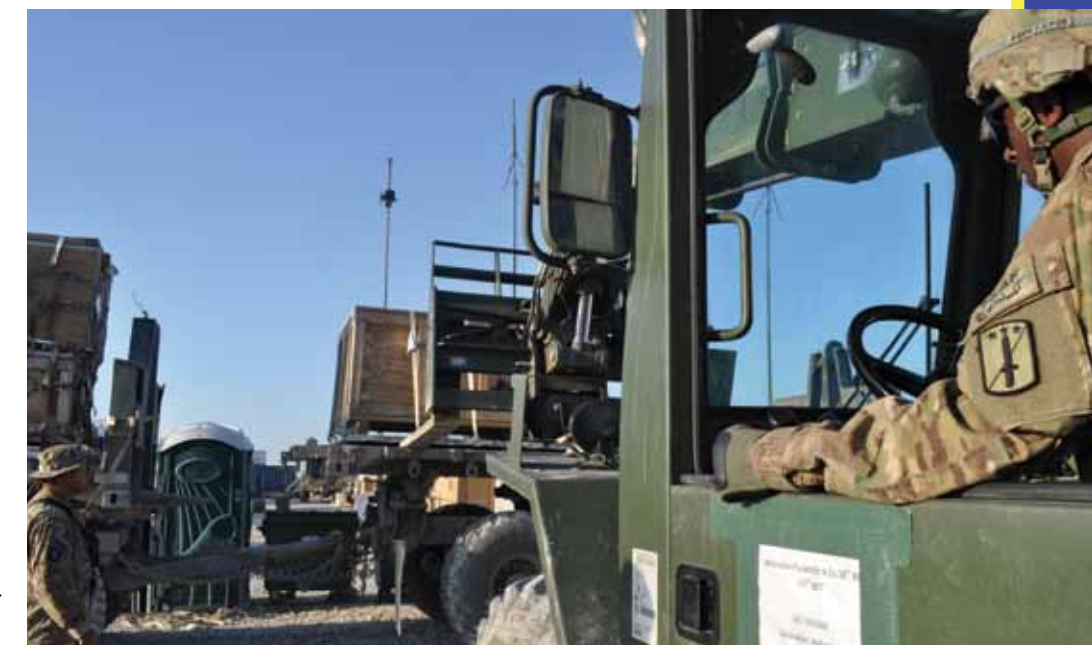
A Soldier of A Company, 24th Brigade Support Battalion, loads class IX (repair parts) onto a load-handling-system trailer for movement to a forward operating base in Afghanistan.

Supply distribution throughout RC North increasingly relied on Afghan trucks to sustain a continuous logistics