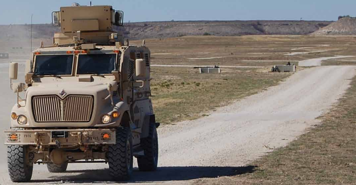
A gunnery crew returns from the range after completing a gunnery table.

Sustainment units often must provide their own protection for supply convoys but seldom are trained to do so. Using a new convoy protection training circular, the 49th Transportation Battalion (Movement Control) conducted gunnery training before deploying to Afghanistan.