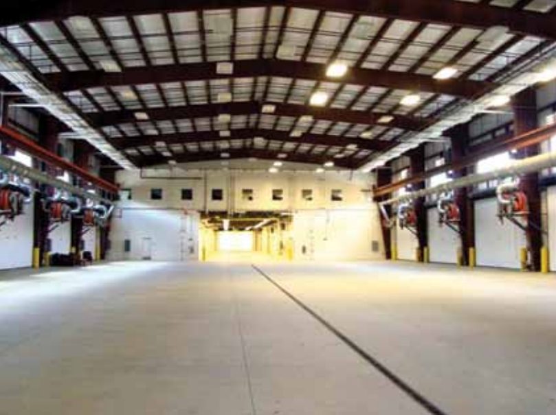
Interior view of a large tactical equipment maintenance facility at Fort Eustis, Virginia.

to meet future requirements, the increased throughput capacity by itself mitigates the effects of budget cuts on efforts to modernize aging TEMF legacy facilities. As a result, even in times of enormous pressure to find ways to reduce expenses, both the immediate past and the current Deputy Chief of Staff, G-4, are committed to continuing to provide new TEMFs that comply with the new TEMF Army Standard to meet the 21st century needs of units worldwide.