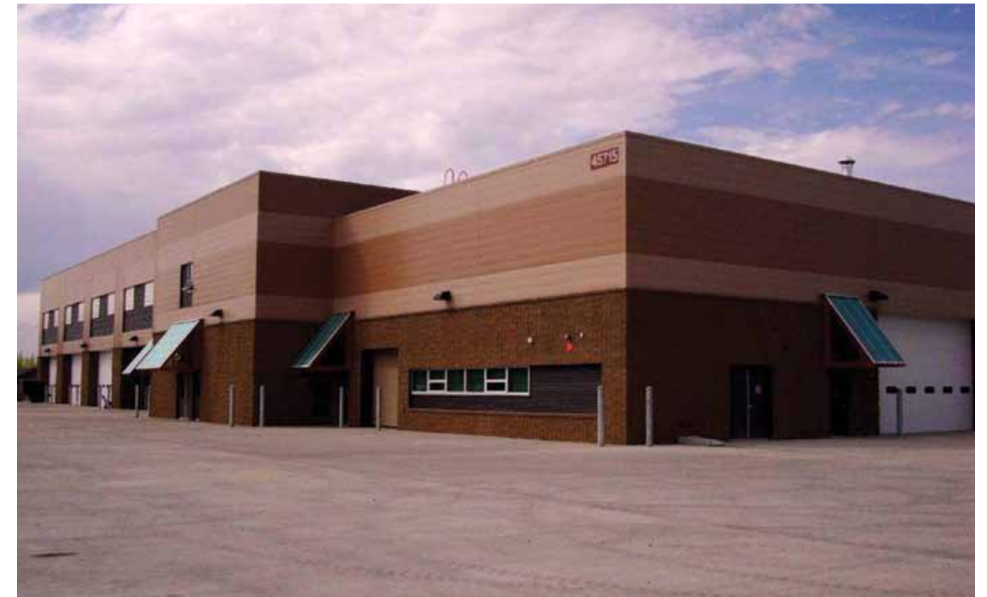
Exterior view of a medium tactical equipment maintenance facility at Fort Richardson, Alaska.

The Army is developing new multifunctional maintenance complexes to meet the demands of the 21st century.