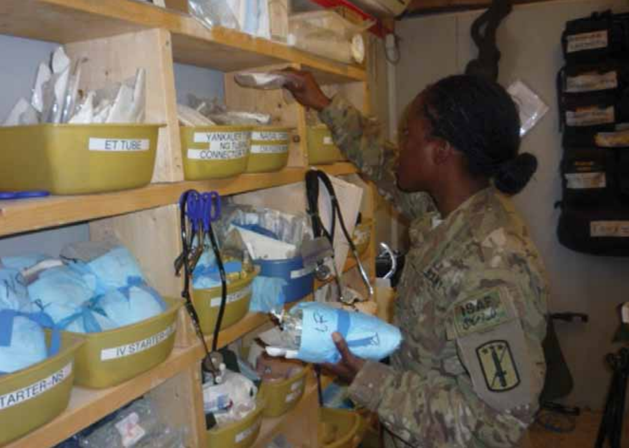
A combat medic restocks the aid station shelves after sick call.

The practice of split-based medical operations is not new. It has proved to be successful across multiple rotations in Operations Enduring Freedom, Iraqi Freedom,