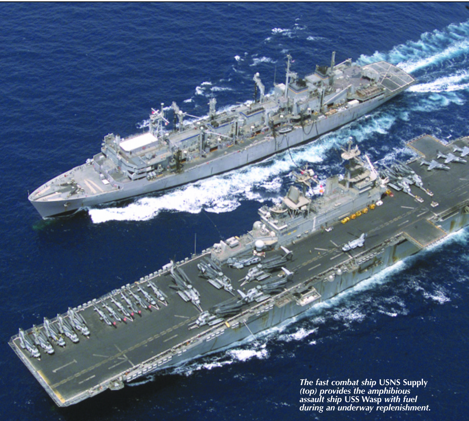
The fast combat ship USNS Supply (top) provides the amphibious assault ship USS Wasp with fuel during an underway replenishment.

BY LIEUTENANT COLONEL JAMES C. BATES, USA (RET.)