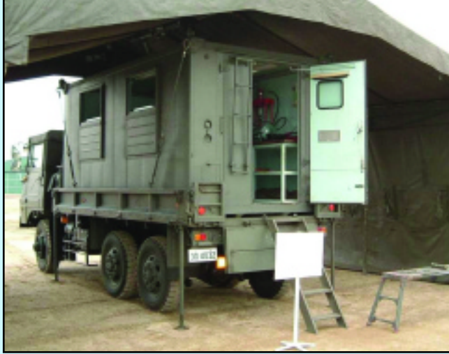
In a field environment, repair parts are made in this type-73 truck-mounted mobile parts fabrication shelter.

Cooperation Law in 1992, Japan began providing support to international disaster relief, humanitarian aid, and United Nations (UN) peacekeeping operations. The JGSDF has dispatched engineer, logistics, and medical contingents in support of international relief and UN efforts around the world, including those in Cambodia, Mozambique, Zaire, and Honduras.