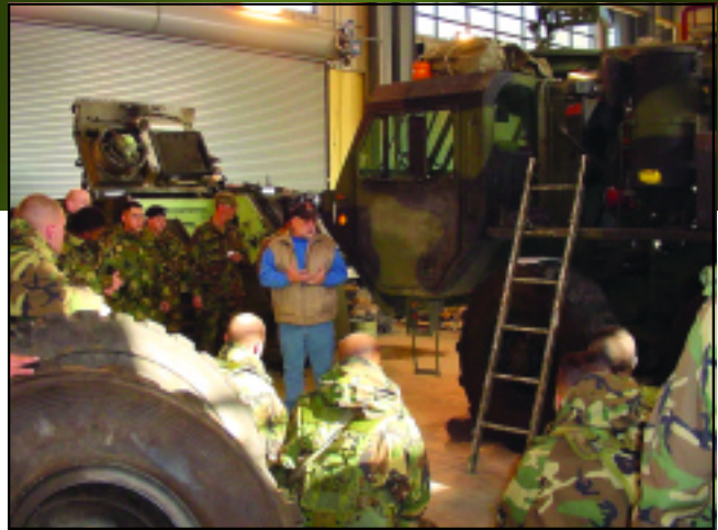
A 2ID LAR instructs Army personnel on the operation and maintenance of the heavy, expanded-mobility tactical truck.

LARs teach many classes throughout the year on a variety of subjects, but three training programs stand out above the rest. They are the School of the HEMTT [heavy, expanded-mobility tactical truck], Mobile STAMIS [Standard Army Management Information