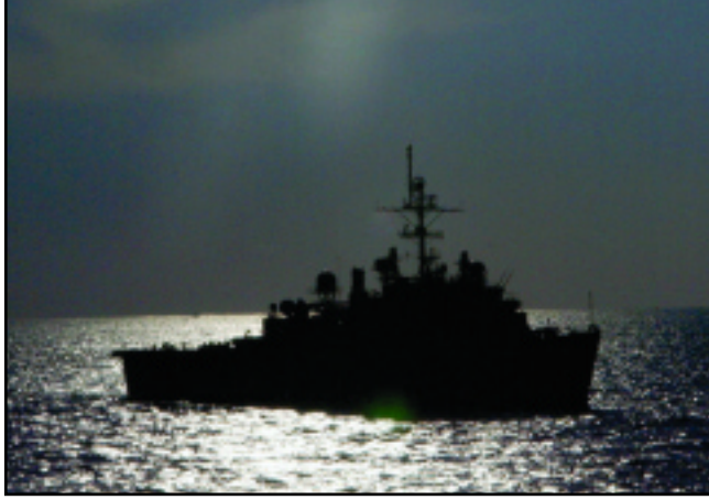
The USS LaSalle, flagship for the Commander, Sixth Fleet, is underway in the Mediterranean Sea.

Guided-missile submarines (Ohio class) are currently being developed by converting four former fleet ballistic missile submarines. They will be nuclear powered, armed with tactical missiles, and have the capability to transport and support Special Operations Forces. They are 560 feet long, and each carries a crew of 155 sailors. They will be able to transport as many as 66 Special Operations Forces personnel each.