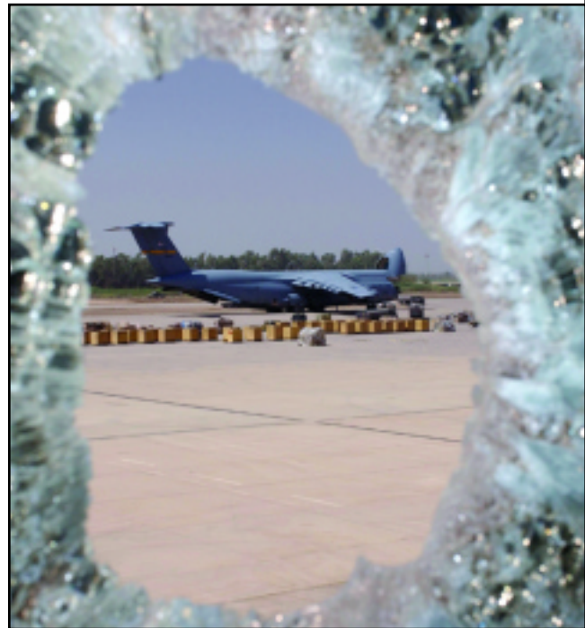
A C-5A Galaxy is viewed through a hole in a window at Baghdad International Airport. The transport aircraft deployed to Iraq from Dover Air Force Base, Delaware, to support Operation Iraqi Freedom.

The Department of Defense's (DOD's) first technology demonstration of Auto-ID at the Defense