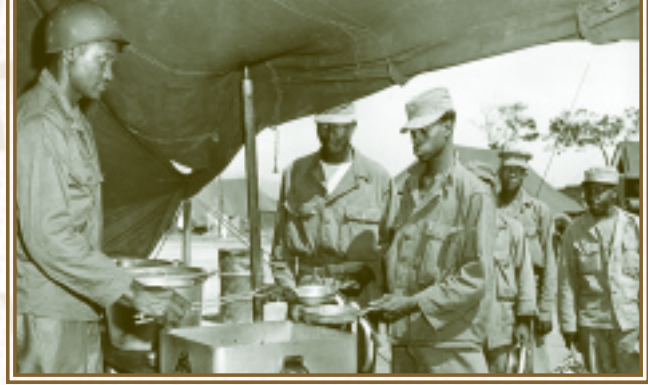
Steak is served to the 43d Transportation Truck Company in Uijongbu in 1951.

The lack of U.S. military readiness received con-