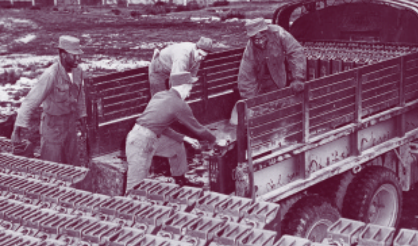
Soldiers load some of the approximately 20 million 5-gallon cans that were used to refuel vehicles during World War II.

By the end of June, over 289,827 tons of supplies had been offloaded onto the Normandy beaches. However, shortages still occurred because supplies could not be discharged from British ports quickly enough and ships could not be turned around fast enough to keep up with the requirements of the landing forces. Therefore, by 15 June, supplies were being shipped directly to Normandy from the United States. At Normandy, supplies were stockpiled on the docks and beaches and then moved to forward units by truck.