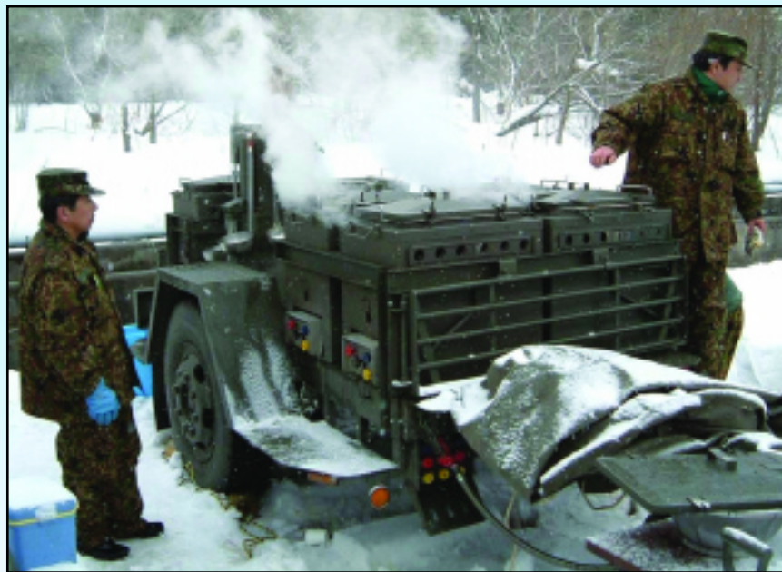
Northern Army soldiers prepare rice for a meal during a field training exercise at the Kami Furano Training Area in Hokkaido.

The logistics support unit's transportation unit, formerly a table of organization and equipment unit, is now a table of distribution and allowances unit. The number of trucks in a regional army transportation unit is based on the number of units supported. The transportation