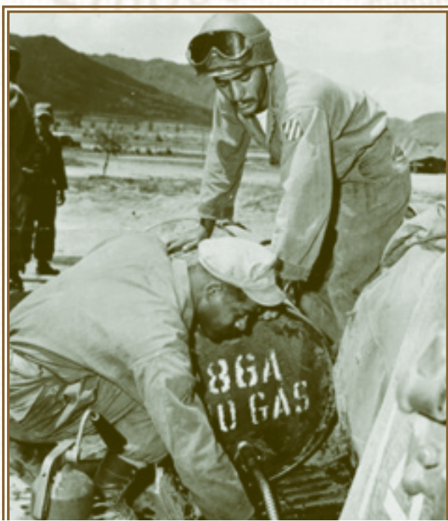
Soldiers of the 3d Infantry Division refuel a tank with a 55-gallon drum in 1952.

September to November 1950: The UN counter-offensive. Rather than attempting to regain the offensive from Pusan, the UN commander, U.S. General Douglas MacArthur, decided to land forces at Inchon, on the west coast of the peninsula just west of Seoul. (MacArthur was the commander in chief of the U.S. Far East Command [FEC] and had become commander in chief of the United Nations Command on 10 July 1950.) Through this daring attack on 15 September, MacArthur was able to surprise and outflank the bulk of the North Korean forces. The Inchon landing, combined with a breakout of U.S. forces from the Pusan perimeter, resulted in the destruction of the North Korean Army and allowed UN forces to