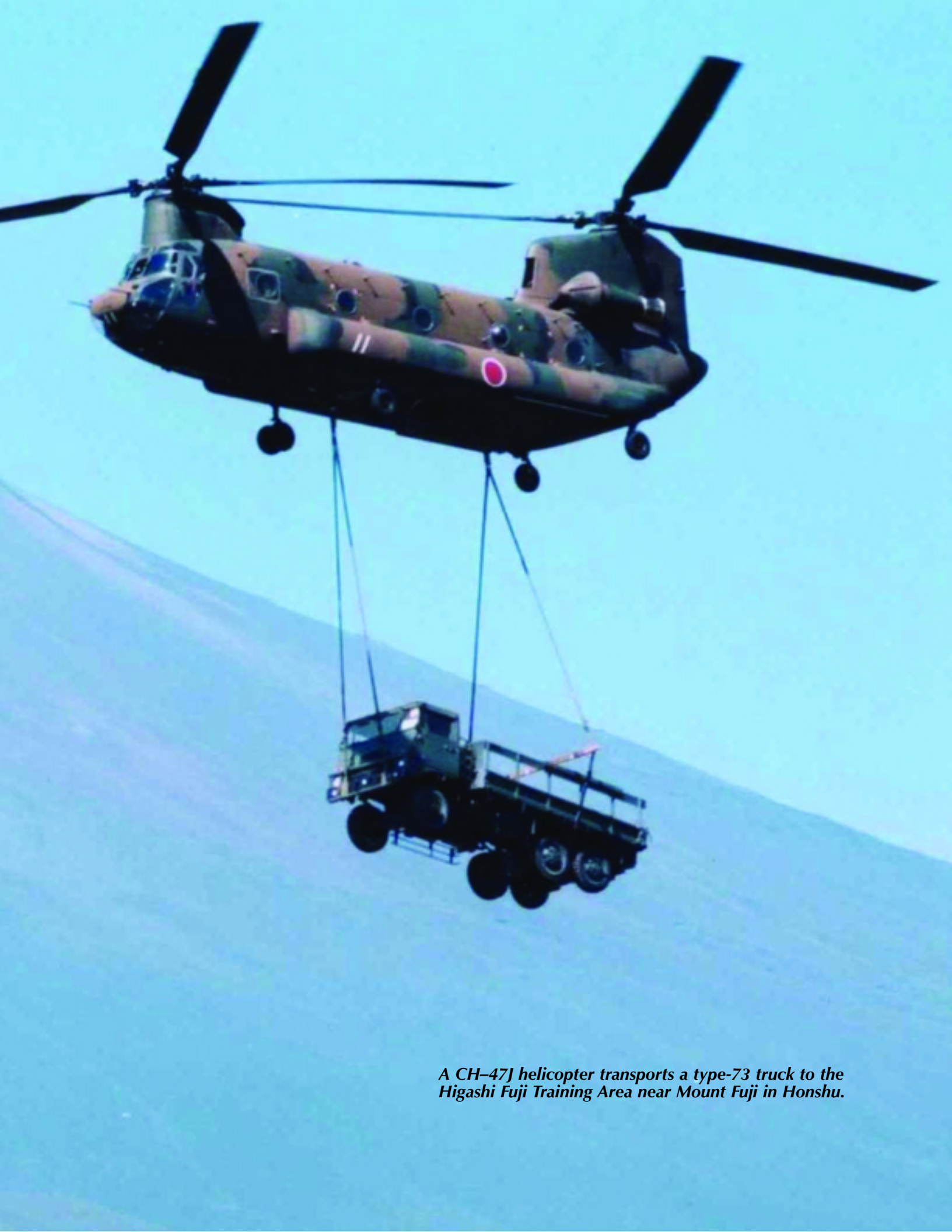
A CH-47J helicopter transports a type-73 truck to the Higashi Fuji Training Area near Mount Fuji in Honshu.