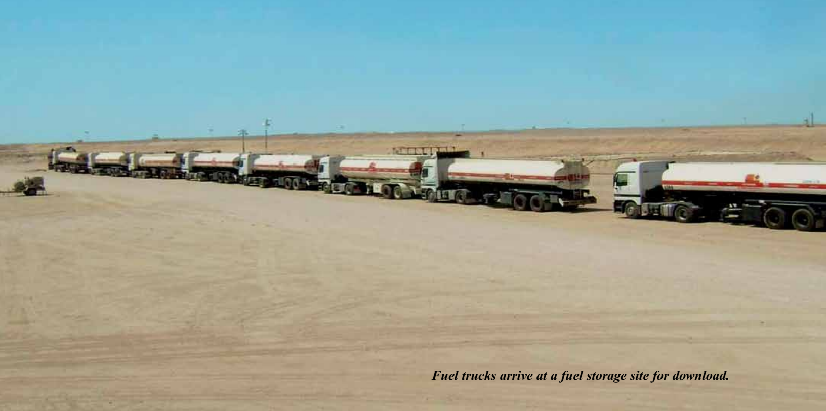
Fuel trucks arrive at a fuel storage site for download.

Since the beginning of motorized warfare, successful execution of fuel distribution has been a major challenge. This challenge remains as great today as it was in World War II. In the beginning of Operation Iraqi Freedom (OIF), one of the biggest successes was the distribution of bulk fuel. Although fuel continues to be distributed successfully, the way it is distributed has changed significantly since the early days of OIF.