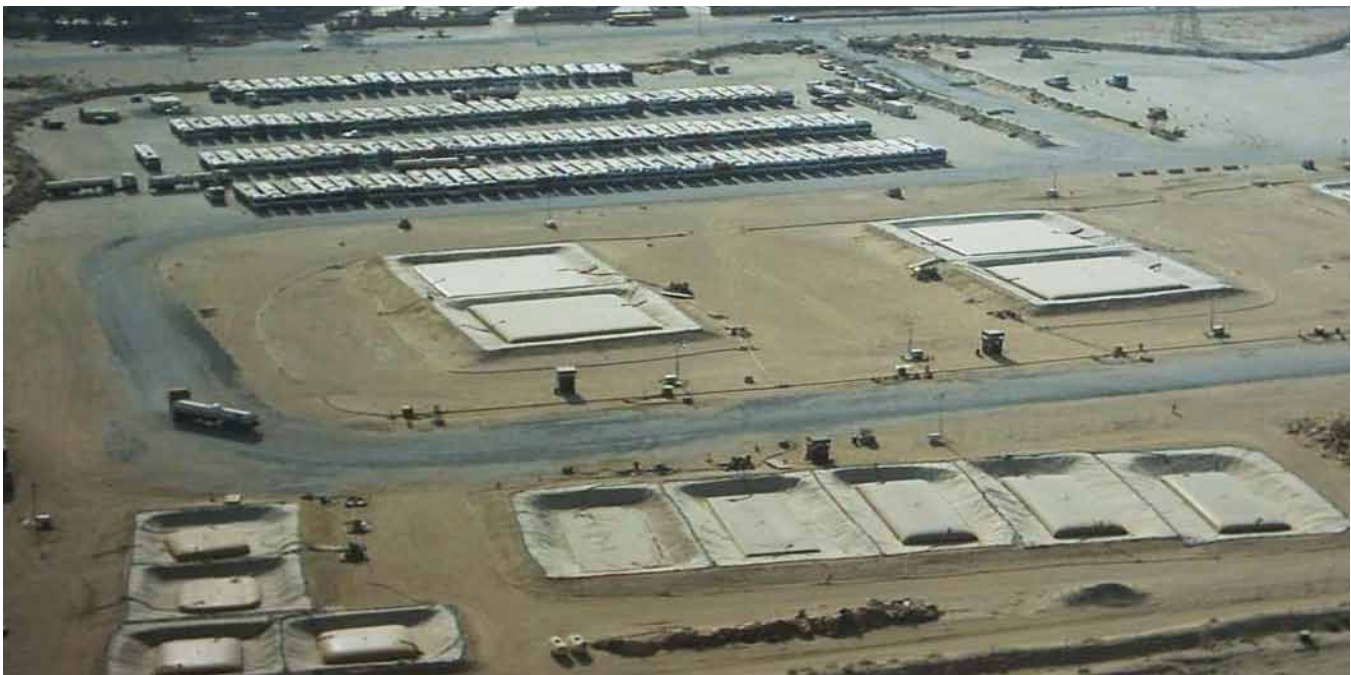
Fuel storage site supporting fuel distribution operations in the CENTCOM area of responsibility.

Turkey delivers fuel to northern Iraq, and Jordan delivers to western Iraq. Fuel requirements in south and central Iraq continue to be supported from Kuwait. Currently, Kuwait provides 57 percent of the JP8 requirement, Jordan provides 28 percent, and Turkey provides 15 percent. Each ground line of communication (GLOC) executes its fuel distribution in unique ways since all GLOCs face different challenges, such as geography, truck availability, or political influences. Currently, the most challenging GLOC of all provides support from Turkey. This GLOC is the most unpredictable and has the longest vehicle turnaround time, which varies from 14 to 24 days. To meet the requirement, the Turkey distribution network requires more vehicles than both Jordan and Kuwait. By contrast, the average turnaround time from Kuwait is about 6 days.