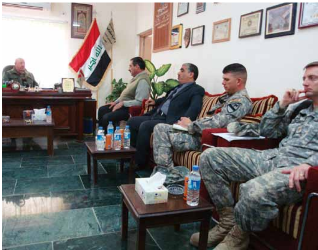
The commander of the Iraqi Army Locations Command meets with his U.S. partners in his office.

The Locations Command clinic provided a robust partnership opportunity. The clinic's commander was excited about continuing the partnership after experiencing the void left by the departure of the 10th BSB. Our first event was an invitation to provide oversight and mentorship during combat lifesaver training and a mass casualty exercise. This was followed by visits from our physician's assistants,