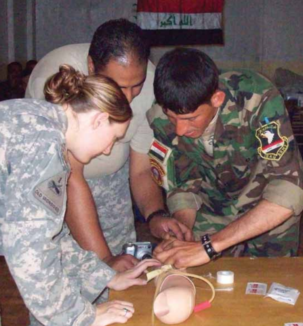
A medic from the 47th Forward Support Battalion uses an artificial human arm to show two 9th Iraqi Army Division personnel the correct procedures for putting an intravenous needle into a patient's vein.

of instruction to their staff officers and NCOs.