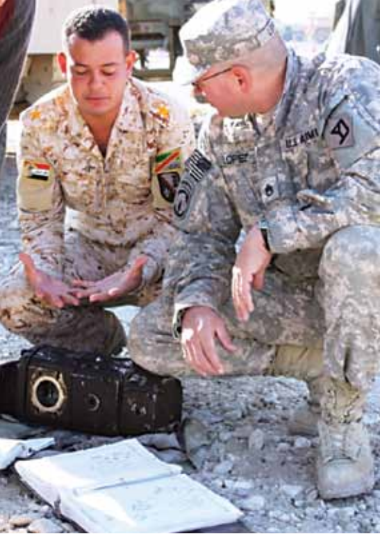
While setting up a supply system for the 6th Iraqi Army Field Engineer Regiment, an Iraqi lieutenant learns how the U.S. military uses the parts manual to order parts.

units becomes negligible. More importantly, visibility of strategic-level plans and decision-making, both on the ISF and coalition sides, increases the probability that actions taken at the LTAT level will support this higher-level planning.