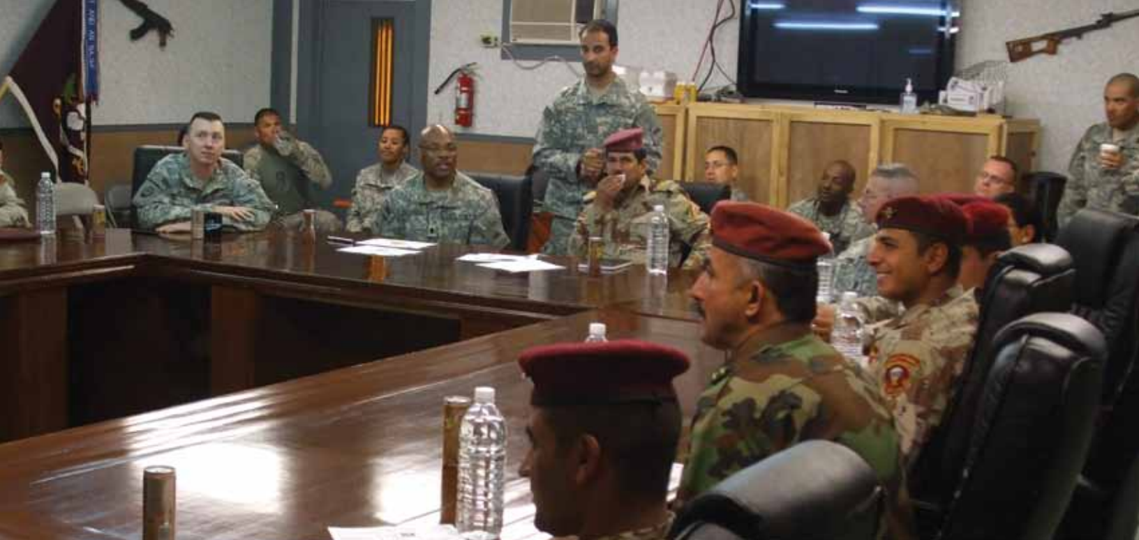
The 47th Forward Support Battalion commander and the 17th Iraqi Army Division Motorized Transportation Regiment commander brief their staffs on the intended outcome of an Iraqi Army division staff visit to Camp Striker.

tics problems and then provided the IA with recommended solutions to their problems. The LNOs advised IA personnel on how the IA system should work and helped them build the confidence needed to address their problems through the IA system, using the coalition force only for reporting and follow-up procedures.