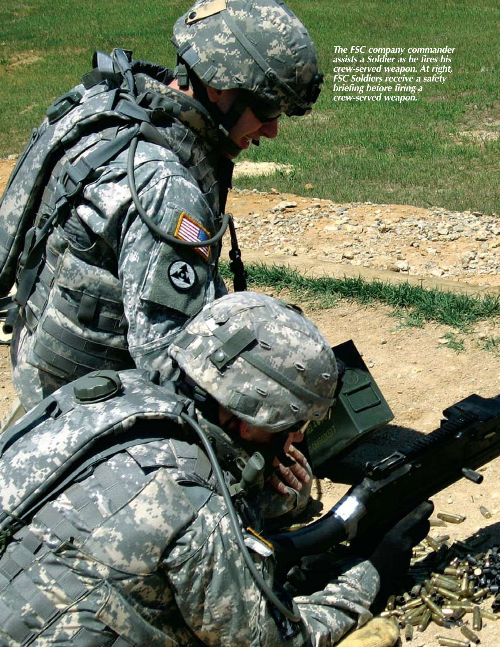
The FSC company commander assists a Soldier as he fires his crew-served weapon. At right, FSC Soldiers receive a safety briefing before firing a crew-served weapon.