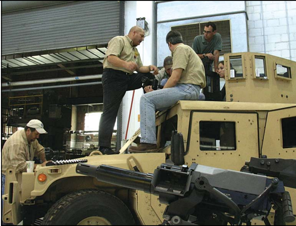
ARDEC designers check the fit of gunner protection kits at the Armament Research, Development, and Engineering Center at Picatinny Arsenal, New Jersey.

placed in a container-like envelope. CONTRAILS can be 10, 12, 14, and 16 feet wide and 40, 45, and 48 feet long. The 40-foot CONTRAIL was designed to stow below decks. All others can be stowed on deck using SBS beams. Most military equipment will fit in the standard 12-foot by 40-foot CONTRAIL. Vehicles are driven into the CONTRAIL using a built-in ramp. Once the vehicle is secured, the CONTRAIL is loaded aboard the ship using standard gantry cranes. With collapsible end posts, the CONTRAILS can be folded when empty for compact storage.