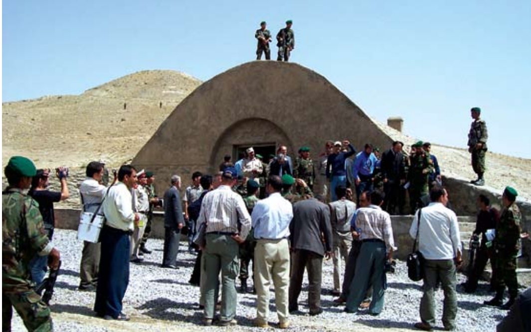
Members of the Afghanistan National Army general staff inspect a renovated ammunition bunker at the opening ceremony of the Khairabad Ammunition Depot.

We found that the Afghans' doctrine was based on what they had learned from the Soviet Union. Under Soviet doctrine, staff officers did not prepare staff