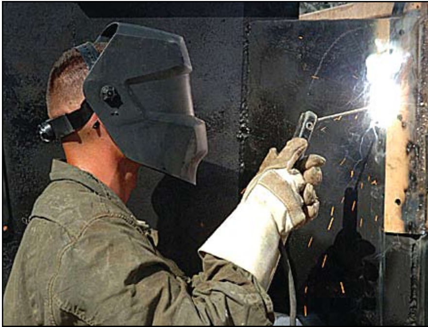
Welders from the 27th Brigade Support Battalion, 4th Brigade Combat Team, 1st Cavalry Division, deployed to Forward Operating Base Marez, Iraq, fabricated the first up-armored pickup truck for the Iraqi police. The truck provides security for Iraqi policemen manning checkpoints. The welders' success led to a tasking to create four more up-armored pickups for the police.