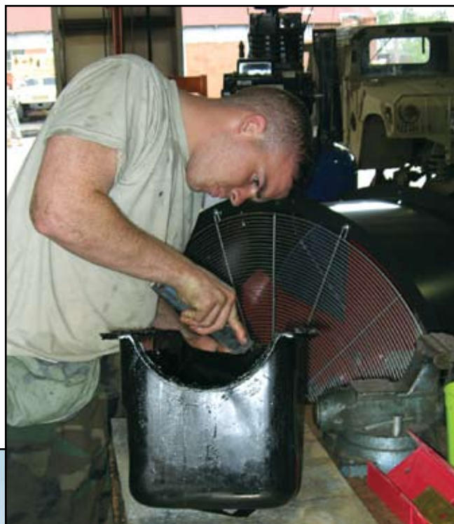
At left, a Soldier reseals the lip seal of an oil pan. Below, Soldiers cheer on their command team as they negotiate the obstacle course to build esprit de corps and unit cohesion.

The 29th FSC is task-organized into three platoons: headquarters, maintenance, and distribution. The maintenance platoon's mission is to provide quality field maintenance on all ground equipment, maintenance management, and recovery for the 525th BfSB. The platoon can generate two maintenance support teams (MSTs) capable of supporting automotive and power-generation equipment forward. The maintenance platoon also has a base maintenance shop that not only has the same capabilities as the MSTs but also can provide limited fabrication and fix weapon systems' communications equipment, special devices, and intelligence electronic warfare equipment. The maintenance platoon maintained vehicle dispatch; repaired and recovered human intelligence