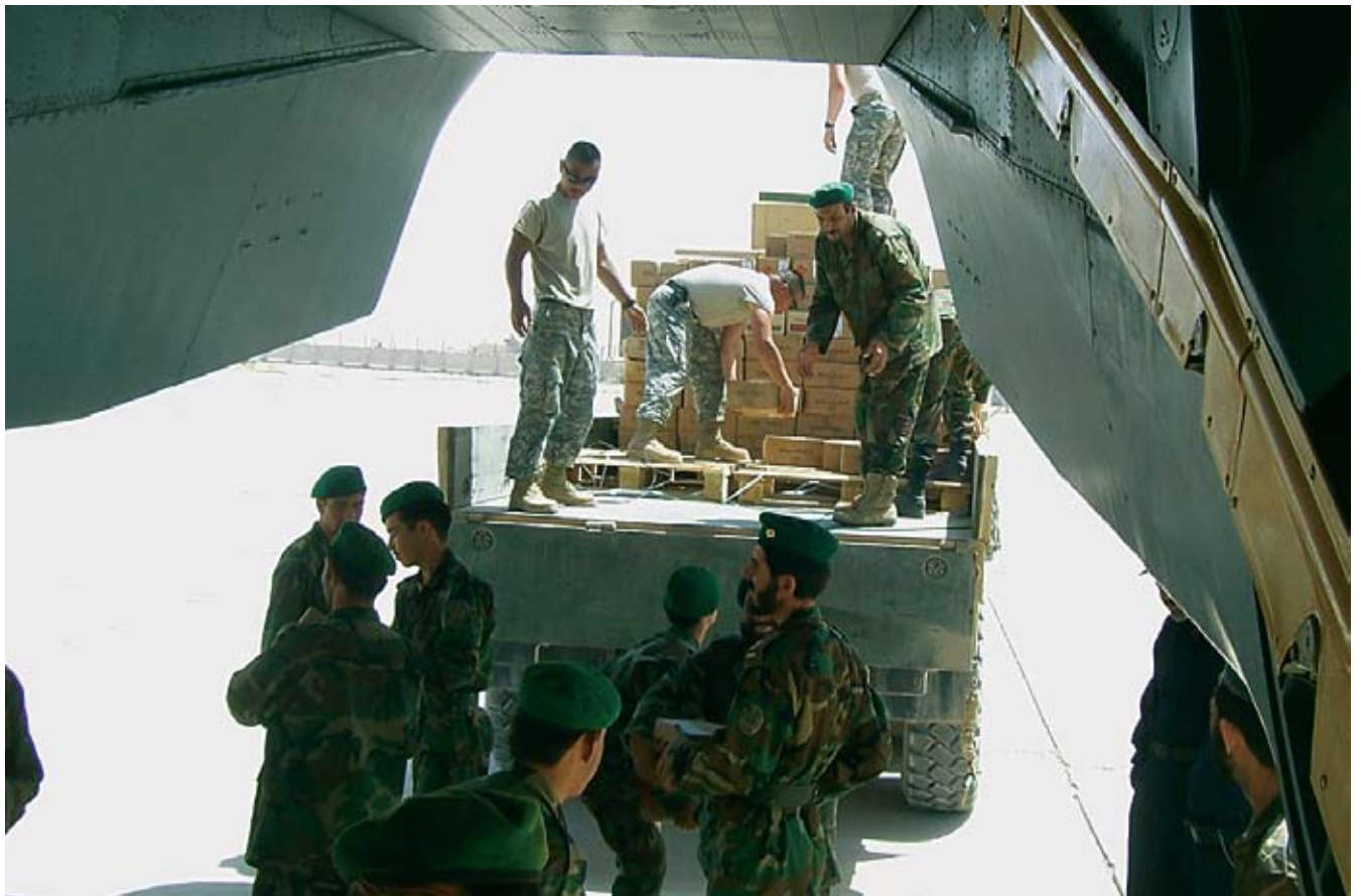
Afghanistan National Army and coalition Soldiers download a shipment of AK-47 ammunition at Kandahar Air Field.

importance of logistics personnel. Afghan commanders distinctly preferred large contingents of combat soldiers to staff officers and logisticians. This prioritization resulted in a severe shortage of personnel in logistics positions. The leaders were predisposed to this mentality, and a change had to happen at the top level to correct it.