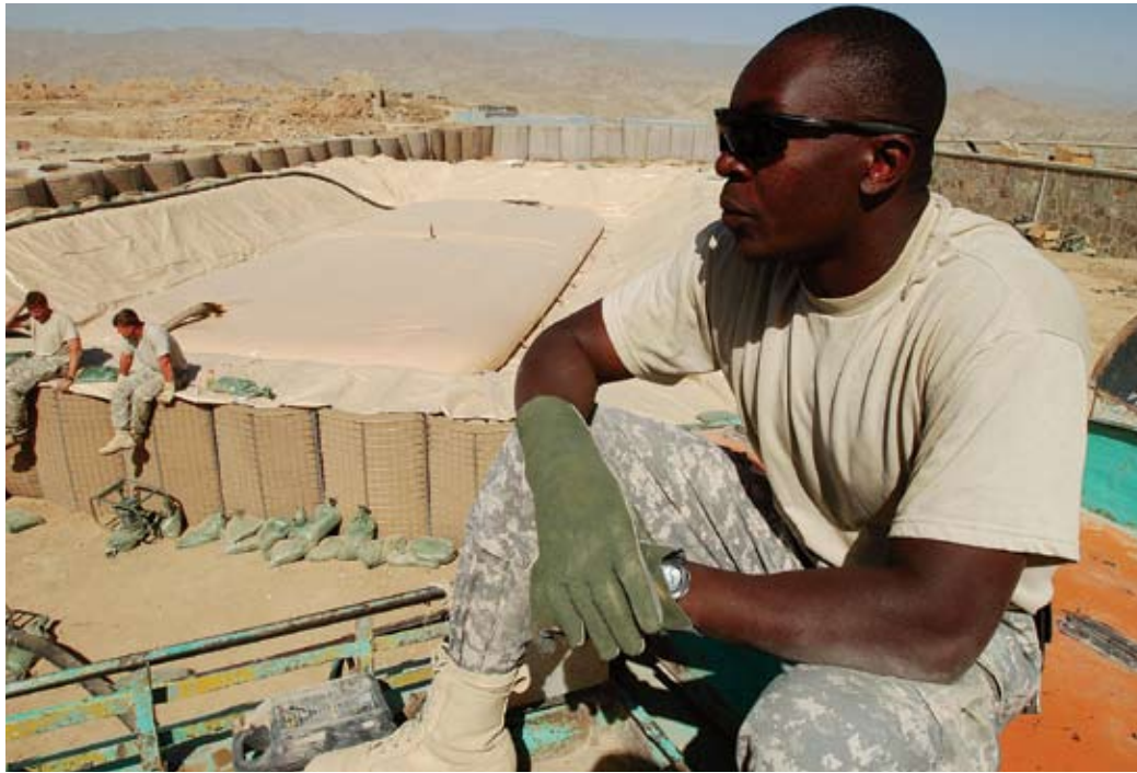
A Soldier sits on top of a fuel truck watching a newly constructed fuel farm being filled.