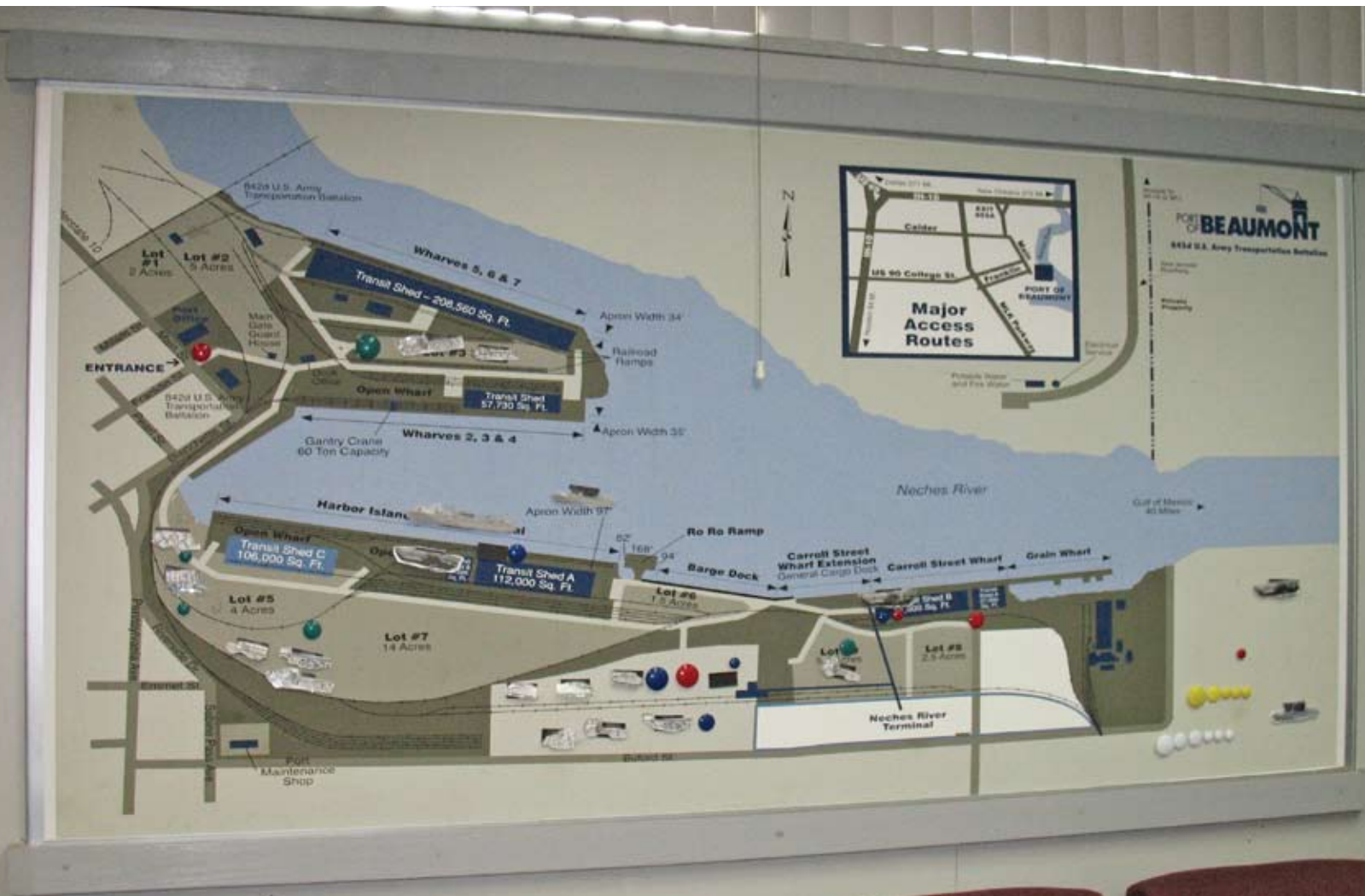
Planners used this map board of the Port of Beaumont while wargaming the courses of action for deploying the 3d Armored Cavalry Regiment.

The battalion staff listed all relevant assumptions, key facts, and decision points. The key decision points