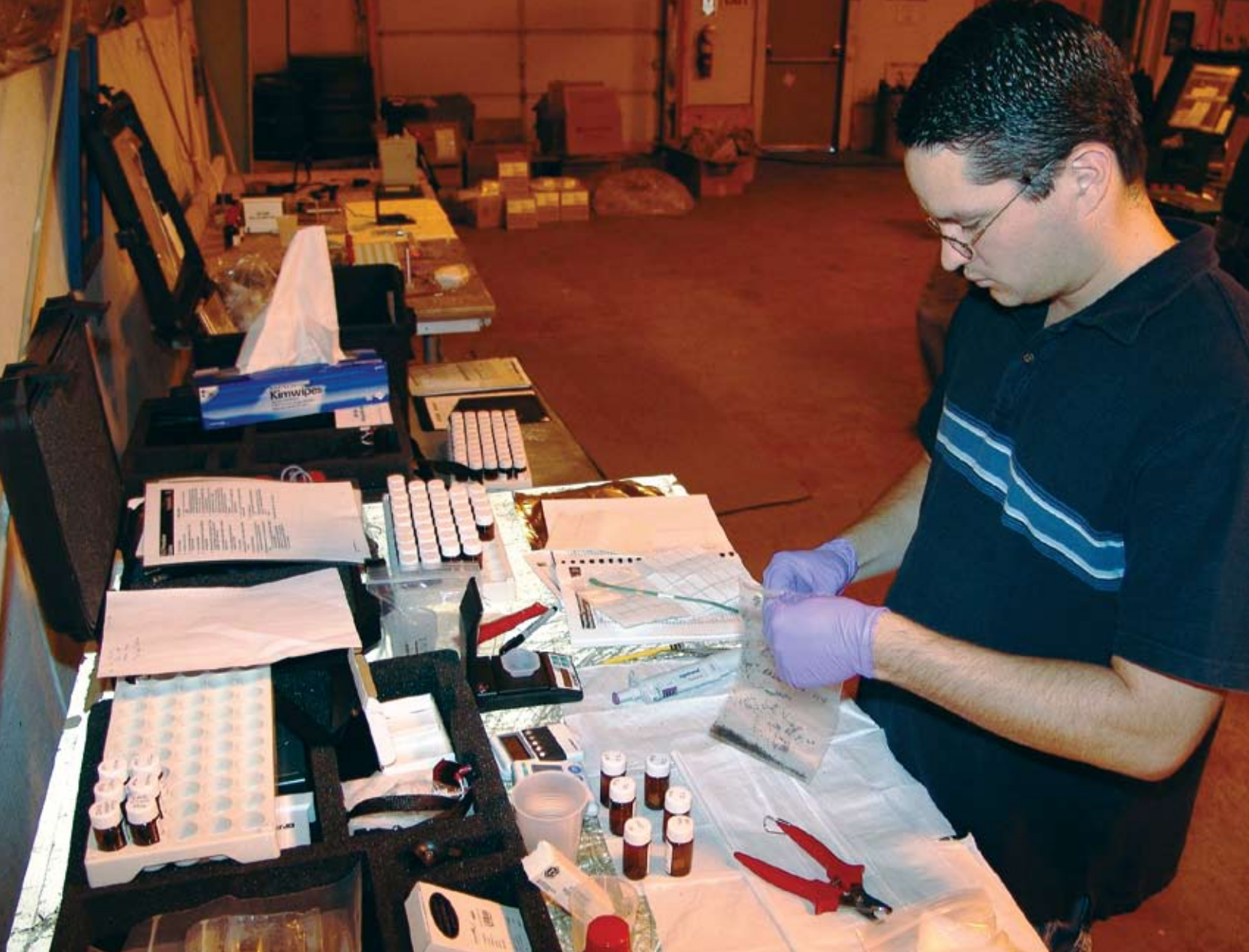
A technician opens a bag to select a propellant test sample during thin-layer chromatography training at Tooele Army Depot.

storage by forcing it to happen much earlier in the laboratory. When a tested propellant lot's "days to fume" reach a defined minimum level, all quantities of that lot, wherever stored, are ordered destroyed. Until 1963, Navy ships had propellant labs on board to conduct this test. Although techniques have improved over the years, the accelerated aging test is still conducted by the Navy service lab at Indian Head, Maryland, and the Army lab at Picatinny Arsenal, New Jersey.