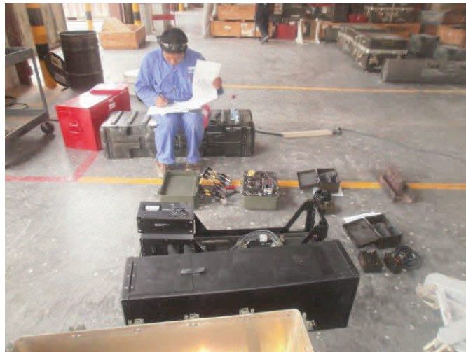
Items being inventoried for shipment or disposition by contractor personnel at Camp As Sayliyah, Qatar.

The next hurdle of the resolution was to reduce costs. Prior to Iraqi Freedom, Army Materiel Command maintained all 28 warehouses within Camp As