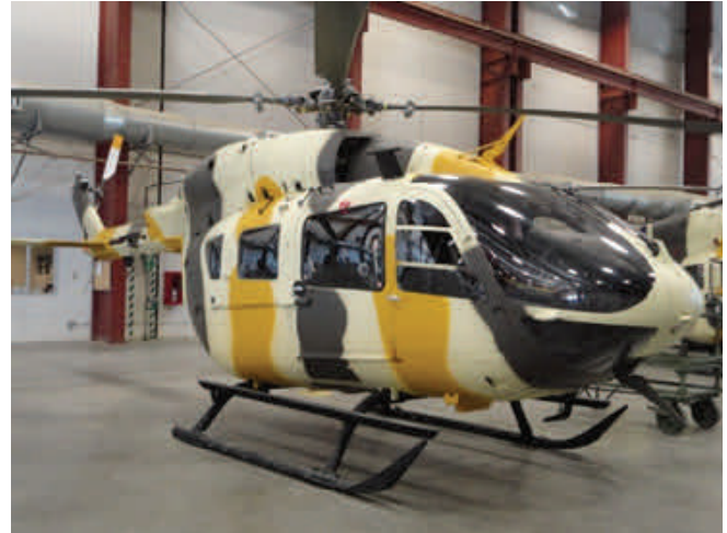
U.S. Army's newest utility helicopter, the UH-72A Lakota.