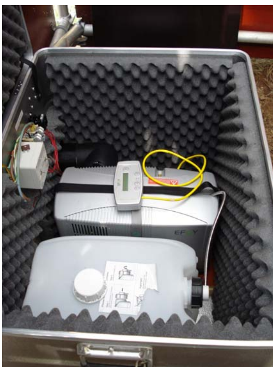
Figure 1: Direct methanol fuel cell installed at Loobos site

carbon dioxide and water." (Direct methanol fuel cell. (2008, September 10). In Wikipedia, The Free Encyclopedia. Retrieved 13:10, September 10, 2008, from: http://en.wikipedia.org/w/index.php?title=Direct_methanol_fuel_cell&oldid=237505556