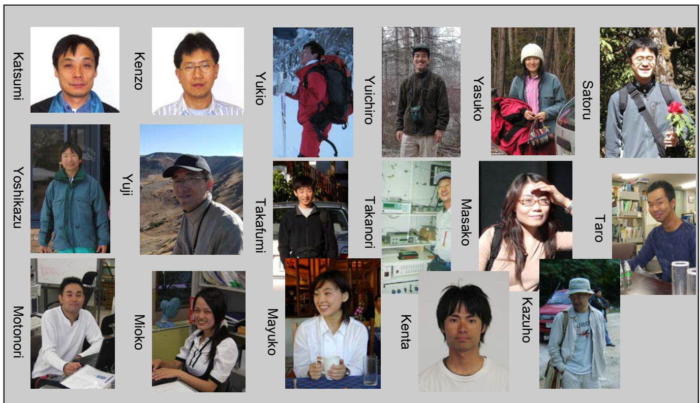
Figure 2: FFPRI team

“FFPRI started the flux observation of heat, water vapor and carbon dioxide at the Kawagoe site in 1995. After the establishment of the fundamental instrumentation, the observation was extended to other six forest sites. This group of sites is named FFPRI FluxNet, since 1999.”