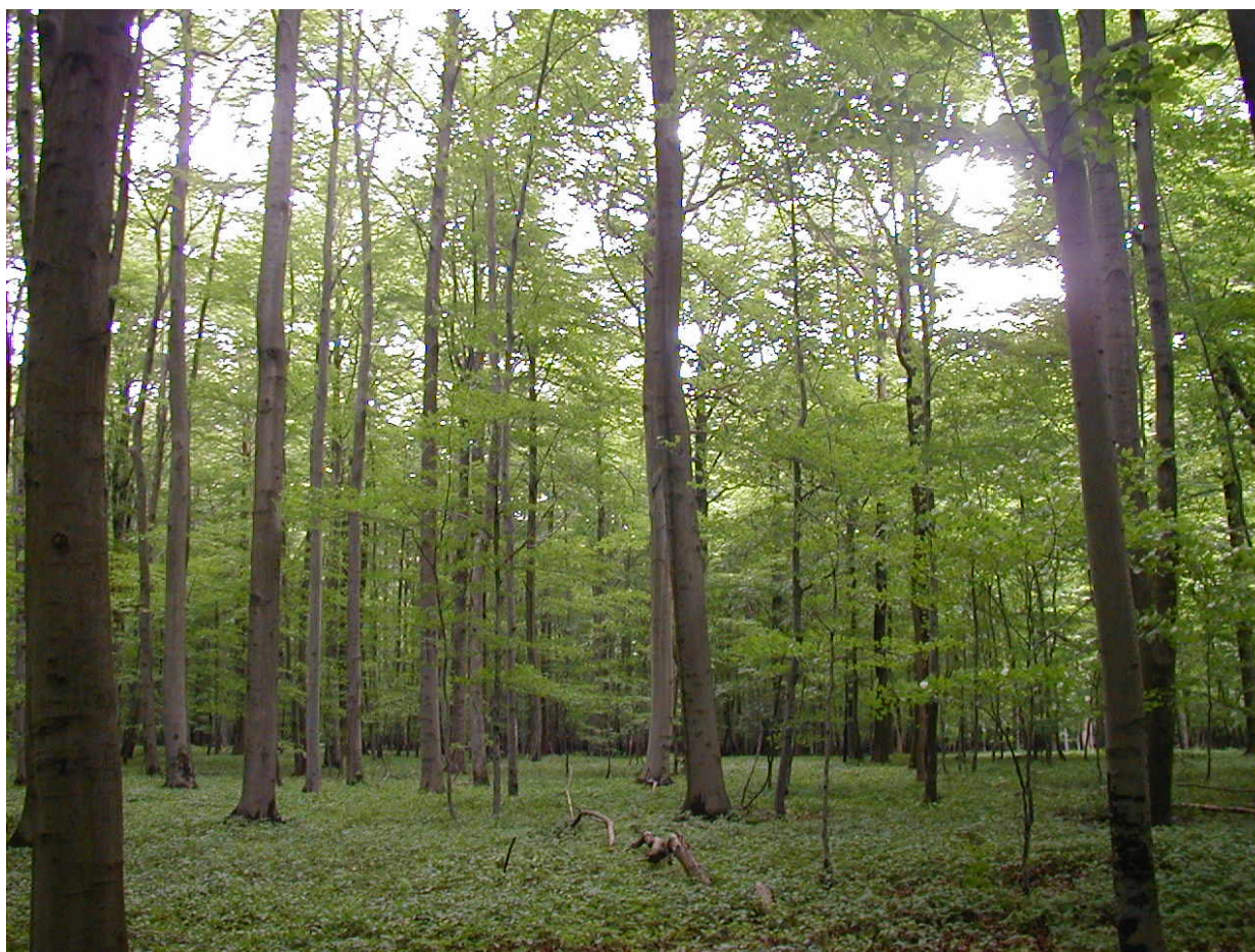
Figure 1: Understory of the Hainich FLUXNET site

Cozzarelli, N. R. (2004) Responsible authorship of papers in PNAS, Proceedings of the National Academy of Sciences of the United States of America , 101(29), 10495-10495