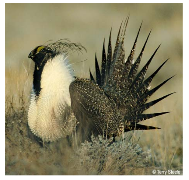
Figure 1. Male Greater Sage-Grouse.

The Greater Sage-Grouse is the largest grouse species in North America. It is 22 to 30 inches tall and can weigh up to 6 pounds. Males are larger than females and feature a white chest and black throat (Figure 1). The Greater Sage-Grouse is classified as a resident species and managed by states as a native game bird. Sport hunting is allowed and regulated in many states.