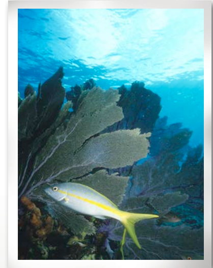
Coral reefs thrive in clear, low-nutrient waters.

The entire South Florida region, including the Florida Keys, Florida Bay and the Southwest Florida shelf, is connected by water currents. Tidal flows take place daily through the channels between the Keys and the bay and between the bay and the Gulf of Mexico. Two large surface currents, the Florida Current and the Gulf of Mexico Loop Current, along with the inshore currents of the shelf, also sweep across the region. Fresh water from the Everglades flows through Shark River Slough on Florida’s southwest coast and then southward toward Florida Bay. The Florida Keys and adjacent coral reef are at the center of this complex and endent system of water movement. The quality of water affecting the reef is influenced by water flows in and around the Keys themselves, as well as by currents originating outside the region.