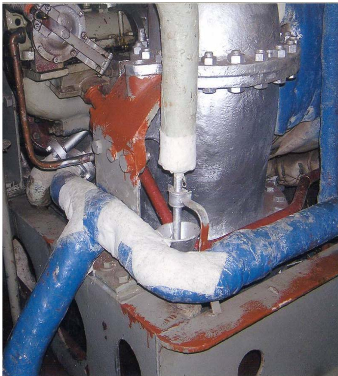
Patched asbestos pipe wrapping on the ex-USS Oriskany.

Undisturbed, this material is not friable. However, once the sheets are exposed to the marine environment, the sheets lose their integrity and can break up and raft. Where possible, these sheets should be removed. Note that asbestos cement sheets may also be used as panels on the vessel. However, these sheets are not water-soluble and therefore should not break apart when exposed to the marine environment. These sheets can stay in place unless cut, drilled or disturbed. Friable asbestos may also be found between bulkheads; this asbestos may remain in place because the asbestos is contained within the bulkheads. If, however, the bulkheads are drilled, cut, or disturbed, the friable asbestos that is now exposed should be encapsulated or removed.