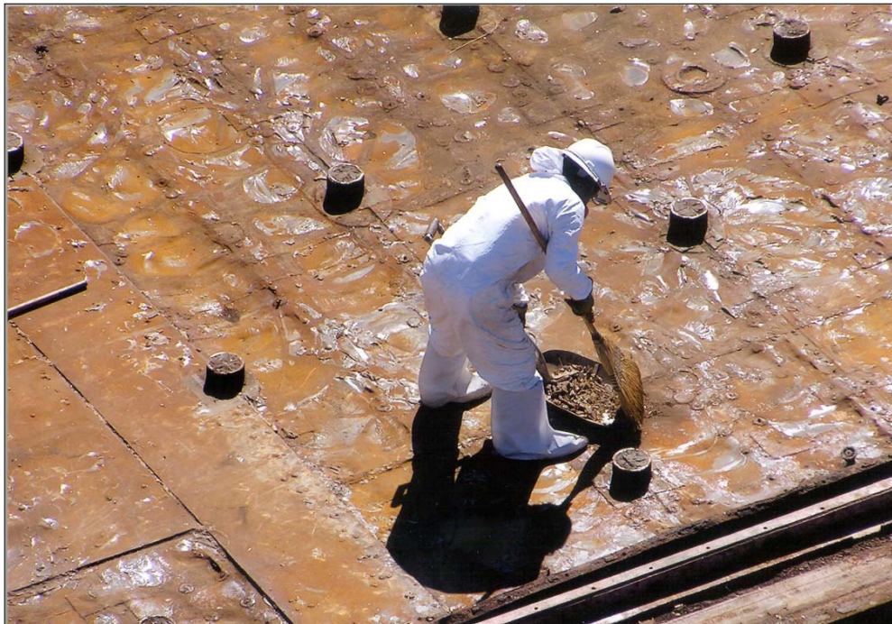
Worker sweeping debris during flight deck removal onboard the ex-USS Oriskany.