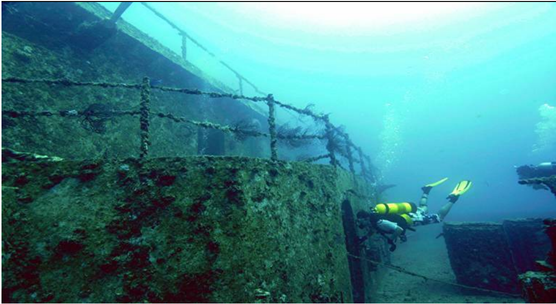
Diver exploring the ex-USS Spiegel Grove artificial reef.