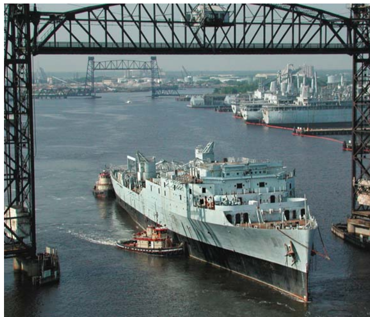
Ex-USS Spiegel Grove, once a MARAD vessel, under way to Florida Keys for final sinking preparations.