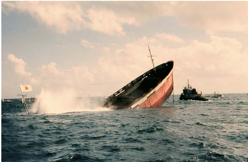
The scuttling of Adolphus Busch on Dec. 5, 1998, approximately 7 miles S of Summerland Key, Monroe County, Florida.