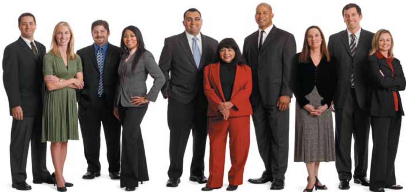
Operation Enduring Freedom/Operation Iraqi Freedom (OEF/OIF) Care Management Team, VASDHS

We provide comprehensive medical, surgical, and rehabilitation services at our medical center in La Jolla and our clinics throughout San Diego and Imperial Counties. Upon enrolling in our health care system, returning combat veterans receive a physical exam as well as screening for traumatic brain injury, posttraumatic stress disorder, military sexual trauma, and other mental health disorders. In addition to screening and evaluation, we offer extensive mental health services, including a Posttraumatic Stress Disorder (PTSD) Clinic, Sexual Trauma Counseling, along with Traumatic Brain Injury (TBI) Care, Alcohol/Drug Treatment, and suicide prevention programs.