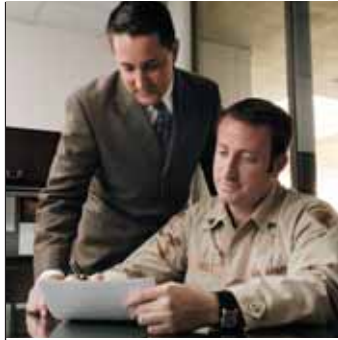
OEF/OIF Care Management Team