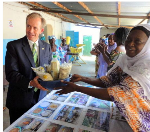
Caption: Members of Koba Club present U.S. Ambassador to Senegal Lewis Lukens with fonio products.

According to legend in some parts of West Africa, the universe began from a single grain of fonio, a type of millet and one of Africa's oldest and fastest growing cereal crops. Now, in Senegal, the highly-prized and nutritious millet is the focus of a $190,000 Feed the Future grant from the U.S. African Development Foundation (USADF) to improve community members' incomes and household food security.