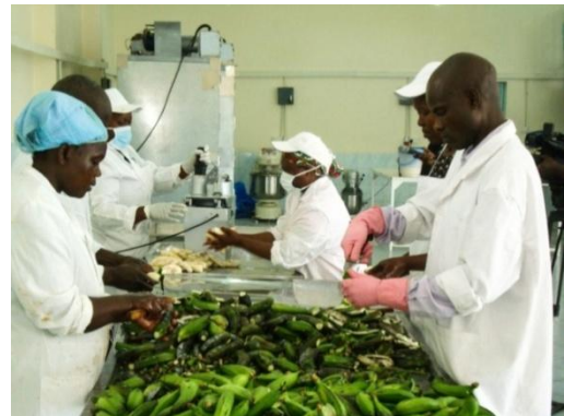
Members of the Nyangorora Banana Processing Group washing, peeling and slicing bananas for processing.

As climate change makes traditional crops like potatoes or maize more difficult to produce, the Consultative Group on International Agricultural Research (CGIAR) estimates that bananas may become an increasingly important food source in Kenya. Looking ahead to an evolving agricultural market, an entrepreneurial group of youth in Kenya's high-altitude Kisii County is investing in value-added banana processing and tissue culture technology, positioning them to meet a potential increase in demand for this crop.