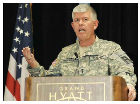
Army Maj. Gen. Mark Graham speaks to 750 military and civilian specialists during the 2009 Department of Defense/Veterans Affairs Annual Suicide Prevention Conference Jan. 12 in San Antonio. See video at <u>http://www. dcce.health.mil/media/DCoE_News/MajGen_Mark_ Graham_discusses_suicide_prevention.aspx</u>

There was also a presentation at the conference on the Army's Battlemind program, which trains soldiers to deal with deploymentrelated psychological health issues before, during and after deployments. Key components of Battlemind include self-con-