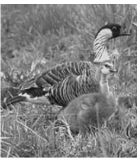
. . . . .

will be updated that will consider potential release-sites on Hawai'i and Maui. After the election of an appropriate release site, significant effort will be expended to improve habitat by removing feral ungulates and removal of rats and cats before reintroduction of 'Alala.