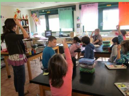
Live call with SAAM and the ¾ class

1 st – 4 th grades experienced a live video call with a curator from the Smithsonian American Museum of Art in Washington, D.C. who shared with them artworks by a few Africa American artists from their collection that we had been working with last month. Our students enjoyed seeing the paintings, hearing about the artists, and being able to ask a bunch of questions!