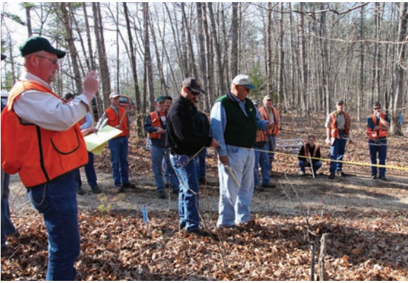
Training foresters.