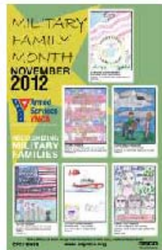
2012 Military Family Month Poster