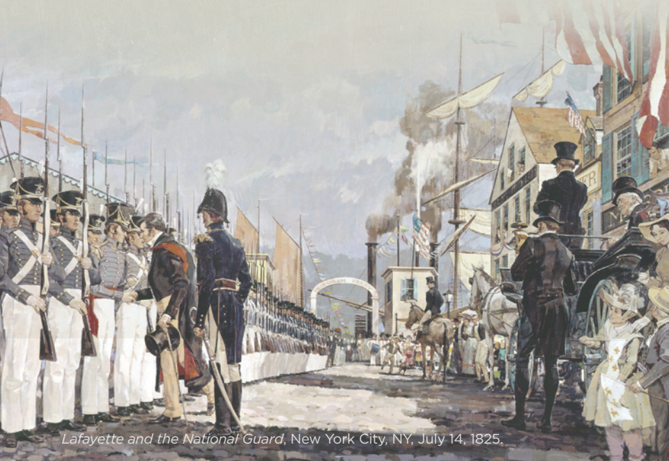
Lafayette and the National Guard, New York City, NY, July 14, 1825.

A premier, unit-based force comprised of resilient, adaptable, relevant and ready Citizen Soldiers accessible for war and domestic crises.