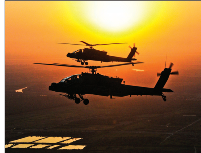
Apaches from the 1-151 Aviation, SCARNG, over Iraq.

The foundational structure needed to deliver the capability required of the operational ARNG is 8 Division Headquarters, 28 Brigade Combat Teams, 8 Combat Aviation Brigades and 2 Special Forces Groups . These core formations must be retained to maintain our operational capability as a member of the Total Force; once dismantled they cannot be quickly rebuilt. Furthermore, experience has shown that in major disasters it is the organic command and control of ARNG combat divisions and brigades that organize the