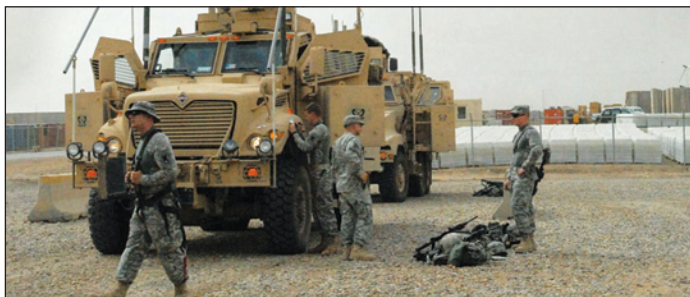
Soldiers of the 1-141 Field Artillery, 256th IBCT, LAARNG, at Camp Adder, Iraq.

While current plans call for a reduction in ARNG end strength to pre-9/11 levels, increased reliance on the ARNG and the uncertain global environment preclude reducing our force any further. This requires manning the force with no less than 350,200 programmed end strength, with a corresponding Force Structure Allowance. Generating readiness in the operational ARNG should be done through a progressive, cyclical model such as Army Force Generation. This would include predictable deployments that enable us to maintain the proficiency we have gained over the past decade. Understanding that dwell times at home will be longer for reserve component units, ARNG deployments should be proportionate to those conducted by the active Army. Army National Guard combat and sustainment units should be tasked to perform the same missions as their active Army counterparts.