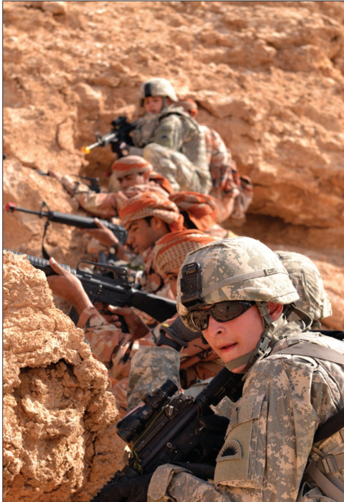
Soldiers from 1-82 Cavalry, 41st IBCT, ORARNG, train with Soldiers of the Royal Army of Oman.