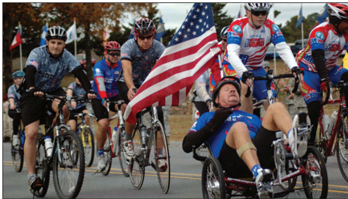
Arkansas Guardsmen participate with wounded warriors in the Wounded Warrior Project Soldier Ride, Camp Robinson, AR.

We will continue to point to our diversity as an organizational strength. Like our nation, our Soldiers are a reflection of the fabric of communities across our states, territories and the District of Columbia. As it has been in the past, our future will be defined by our strong and historical reputation for being good stewards of resources, good neighbors and trusted leaders within our communities. The core strengths, character and culture of the ARNG are a constant. They have served Citizen Soldiers, communities and the nation well... for more than 375 years.