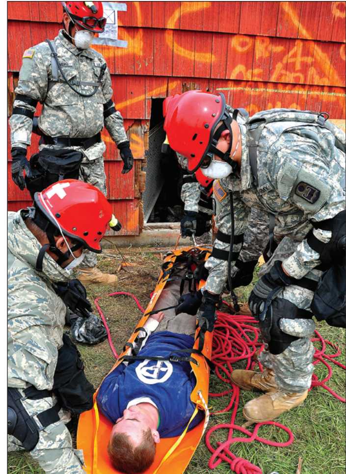
Members of a Chemical, Biological, Radiological, Nuclear and High Yield Explosive Enhanced Response Force Package from Puerto Rico rescue a “victim” as part of an exercise in Salem, OR.

To ensure we can carry out our domestic responsibilities, we must focus on sustaining our critical dual-use equipment at a minimum of 80 percent on-hand and ready . This best practice takes advantage of economies of scale as well as generating cost efficiencies—whether ARNG units are serving abroad or at home.