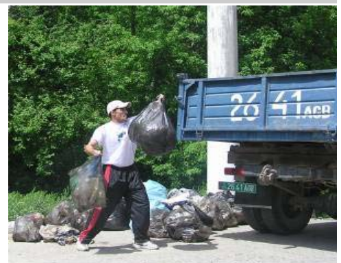
Pages 3-4 Featured: Earth Day 2005 pictures

4-9 Alumni Beat: Project Smile Grant, CI alumni in the news, Tashkent conference