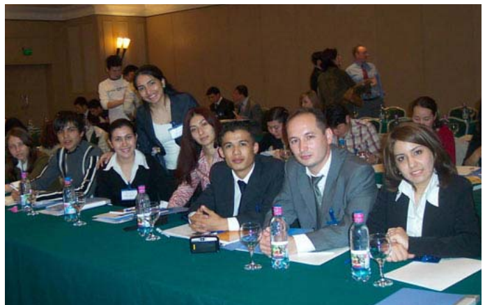
Turkmen UGRAD team at the conference

Eurasian Undergraduate Program alumni of Central Asia gathered in Tashkent, Uzbekistan for a conference entitled "Mass Media in Central Asia," held on March 10-13. Turkmenistan UGRAD alumni attended the conference and participated in lectures, workshops and discussions devoted to media development in Central Asia. Professional journalists and experts shared their knowledge and experience in broadcasting, interviewing, managing news reports, and other issues. Media specialists also moderated panel discussions on the contribution of mass media to public opinion and the influence of foreign media. Alumni had a chance to develop their journalism skills by creating their own TV reports on topics such as volunteering, working with youth and educational opportunities. Alumni were encouraged to create follow-up projects specific to their home regions to implement after the conference. Participants also enjoyed the unique opportunity to tour Tashkent and Samarkand.