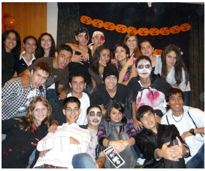
A group photo

On October 31, over 20 FLEX alumni organized a concert dedicated to Halloween at the Turkish Cultural Center. The concert, called "Once upon a Halloween night", gathered over 200 visitors. The event included dances, play "Twilight Mix", raffle, children's games in the auditorium, and a video about Halloween. The main goal of this event was to introduce and explain Halloween to the general public: to promote understanding of how Halloween is celebrated in the USA and how FLEX alumni brought this celebration to Turkmenistan. Before the concert, the alumni held a pumpkin carving contest where they chose the best jack-o-lanterns and the winners were shown at the performance.