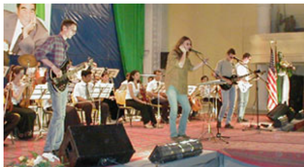
The "Black Jack" Band performing Eric Clapton's famous song "Tears in Heaven".

On the 4th of July, "Neutralniy Turkmenistan" newspaper published an article about the United States under the headline "Republic of Sciences." The article, about the development of sciences and the most prominent scientists and scholars throughout American history, was written in response to requests from readers who had seen the American Culture Week Photo Exhibit at the National Library and wanted to know more about the U.S. A picture truly is worth a thousand words!