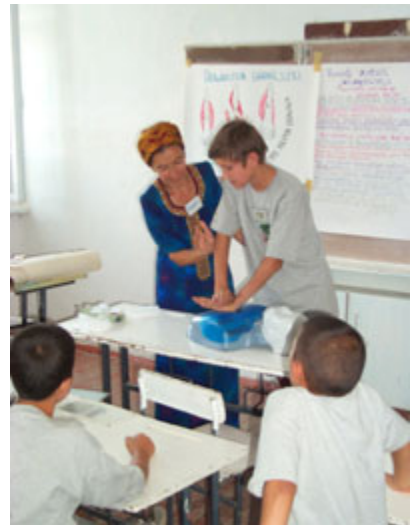
A camper learns how to do CPR at the Yoloten Health Camp.

successful. They taught some classes and served as counselors. Zdrav Plus, a health NGO operating throughout Central Asia, provided financial support for the camp. The Yoloten Education Department and the director of School #2 provided necessary facilities to hold the camp.