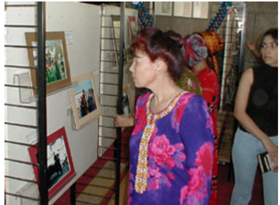
A visitor to the photo exhibit observes Turkmenistan from an American point of view.

The Embassy also presented a variety of American-style entertainment opportunities, including an American Movie Festival, a concert in the park, and an amateur production of one of William Shakespeare's most beloved comedies. Six American movies for young and old alike were presented to Turkmen audiences and featured well-known classics such as "The Magnificent Seven" and modern hits such as "Monsters, Inc."