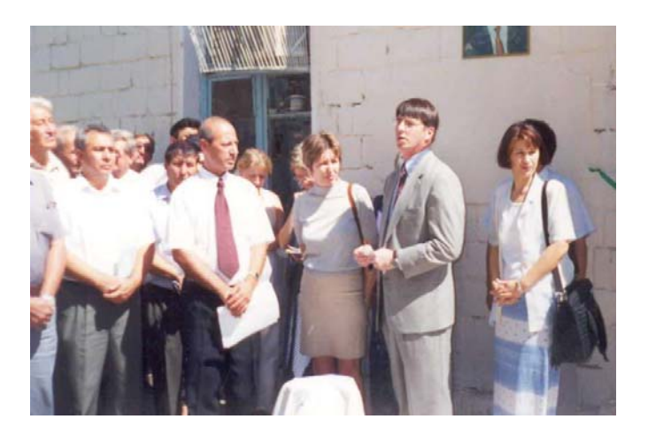
City Polyclinic. The Center for Disease Control will provide training of the laboratory technicians from the TB Department of Turkmenbashy.

The U.S. Agency for International Development (USAID) together with Turkmenistan's Ministry of Health opened a new Turkmenbashy. tuberculosis laboratory in The Tuberculosis Laboratory, opened August 1, 2001, is located in the TB Department of the City Multiprofile Hospital of Turkmenbashy. This is the second laboratory of its kind in Turkmenistan. The project is being implemented by USAID partners Project Hope and the Center for Disease Control in cooperation with the Tuberculosis Department of Turkmenbashy. This laboratory responds to a critical need in Turkmenistan to provide healthcare to people affected by tuberculosis. Last year, the Ministry of health and USAID formally agreed to implement a short course on treatment. This led to the establishment of the first pilot laboratory in Ashgabat. Project Hope will provide the new laboratory with equipment and supplies, as well as office equipment for the Learning Center. Project Hope also supplied TB prevention drugs for 250 patients and clinical skills training TB physicians and family practitioners of Turkmenbashy