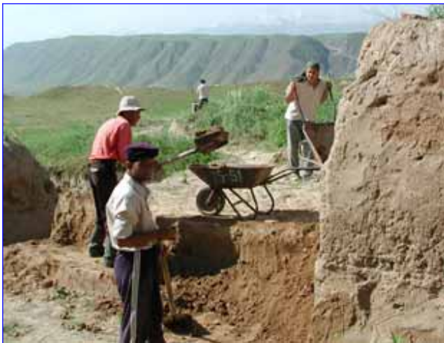
Turkmen archaeologists searching for fresco fragments in the ruins of Nisa.

This is the second joint cultural preservation project sponsored by the U.S. and Turkmen governments. In 2002, the U.S. Embassy, through the Ambassador's Fund for Cultural Preservation, and the National Administration for Historical and Cultural Monuments of Turkmenistan presented a completed mosaic restoration project at the Seit Djemaletdin Mosque in Anau. Currently, the Embassy is sponsoring a project on saving the shrine of Abu-Sakhyt Abu'l Khair, a unique 11 th century historical monument located in Kaakhka etrap, 200 kilometers to south-west from Ashgabat, and restoration of thirty 17 th and 18 th century Turkmen carpets and carpet pieces.