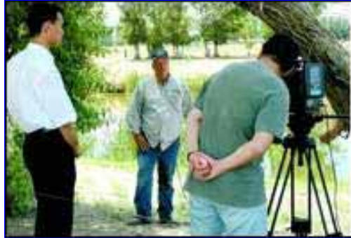
A Nevadan farmer (center) is interviewed about the crops he grows by the Turkmen TV crew.