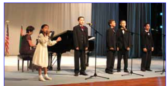
Young vocalists from the Ashgabat Musical School #2 perform George Gershwin's "To the Motherland".

Concert of American Music garnered a wave of favorable media attention.