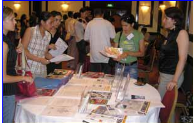
At the Career Fair, alumni learned about employment opportunities with various companies and organizations.

This real-world experience provided alumni with the opportunity to stretch their job search muscles and improve their prospects in the marketplace.