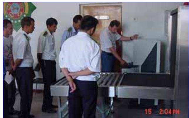
A Wlibor Systems engineer conducting a training seminar on X-ray machine operation.

The HI-SCAN 100100V X-ray scanner is specifically designed to meet the needs and applications of airports, customs facilities, transportation operations, carriers, parcel services and warehouses to screen oversized packages without any loss of X-ray image quality. It offers technologically advanced security solutions to detect and identify explosives, chemical & biological agents, weapons and contraband.