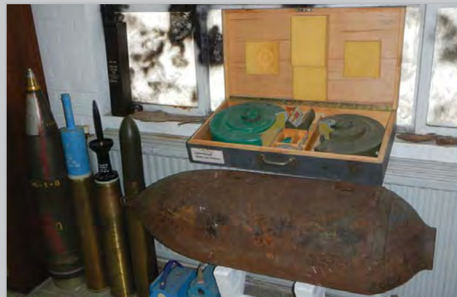
Among explosives disabled by the EOD are antitank mines (top right) and WWI bombs (bottom right).

EOD, we know that we have a superb team only a short distance away."