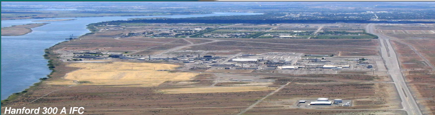
Hanford 300 A IFC