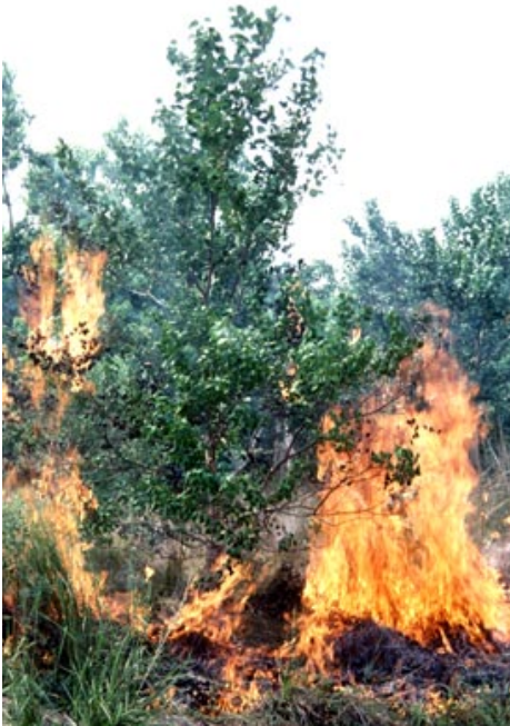
Chinese tallow being burned by winter fire.

burns, and that prescribed fire may indeed be a key in holding Chinese tallow at bay.