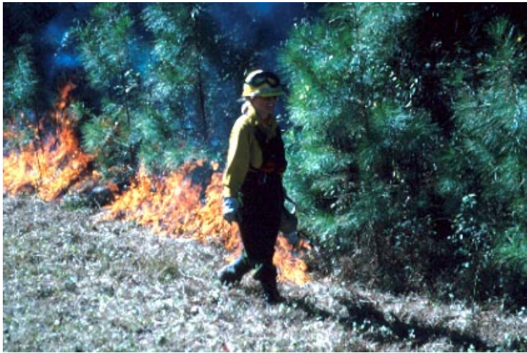
USGS researcher assisting in a prescribed burn at the Kisatchie National Forest. Prescribed fire is now a primary tool in land management and restoration efforts.

The new Federal Wildland Fire Policy recognizes that past practices of aggressive fire suppression have led to conditions of historically unprecedented fuel loads, or