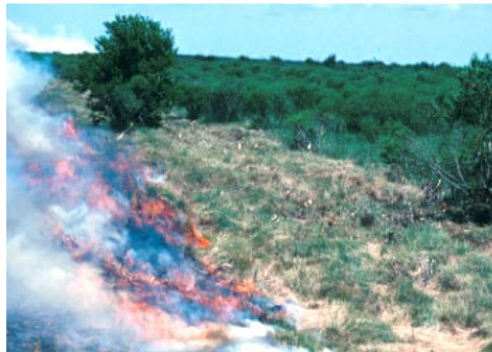
Prescribed fire on coastal prairie at the Brazoria National Wildlife Refuge. Before the coastal prairie became settled, fire was a sustaining force in the ecosystem. Low-intensity natural fire kept woody growth in check, yet the roots and bulbs of the native grasses remained undamaged. Fire suppression practices allow the accumulation of plant litter and other flammable materials and therefore increase the likelihood of a destructive, high-intensity wildfire.

NWRC scientists have been experimenting since 1996 with controlled burns in both the dormant season and the growth season to study the effects of timing of burns on Chinese tallow stands. Evidence so far indicates that burns conducted during the growth season are more effective in the long term than traditional dormant-season