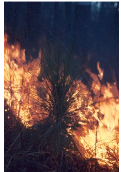
Historically, fire's destructive force has been viewed as an enemy of both humans and native species.

Historically, human influences have dramatically altered fire effects on the North American landscape. Native Americans used fire to change vegetation patterns prior to European colonization. Following European settlement, fire became viewed as a natural force that should be controlled. Throughout much of