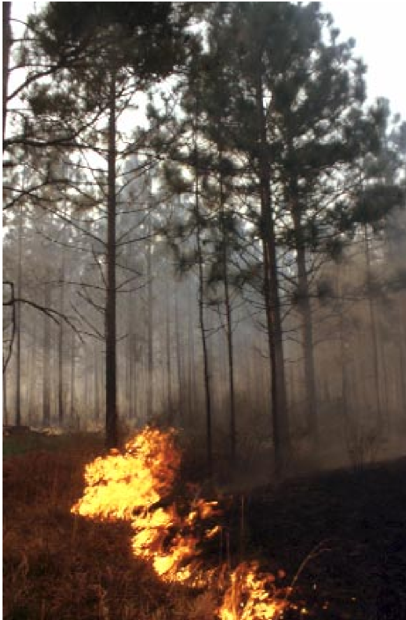
Fire, whether naturally occurring or prescribed, has a vital function in the ecosystem. Fires, such as the one shown here at Kisatchie National Forest, eliminate dead or dying plant matter, stimulate growth of native plants, and suppress the invasion of exotic species and the succession to woody species in many natural plant communities.

U.S. Geological Survey/National Wetlands Research Center, 700 Cajundome Blvd., Lafayette, LA 70506; 337-266-8500; Fax: 337-266-8513; http://www.nwrc.usgs.gov