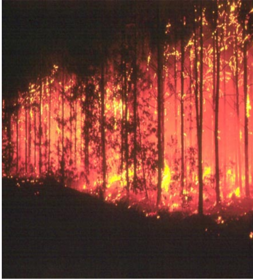
Although catastrophic fires like the ones in Florida in 1998 may have devastating impacts on timber resources, they may also prove to have ecological benefits. This photo shows catastrophic fire where torching and crowning are common.

At another study site, a freshwater coastal marsh in Louisiana, short-term burn history maps were generated using Thematic Mapper imagery. These maps cover winter preburn, spring recovery, and summer regrowth of