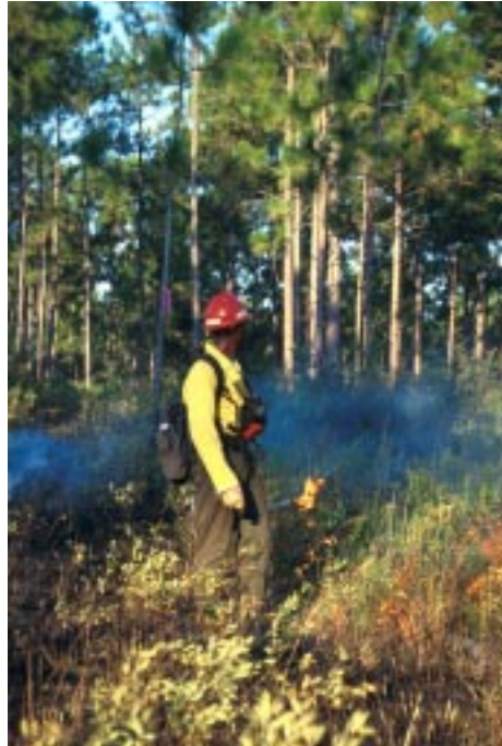
At the Mississippi Sandhill Crane National Wildlife Refuge, fire is mainly applied in the fall and in the spring. Fall fire reduces overstocked planted slash pine and enhances crane nesting areas, while spring fire clears unwanted woody vegetation from overgrown areas on the savannas.

Historically, fire was a naturally occurring phenomenon in the wet pine savannas, shaping the appearance of the landscape by burning off grasses, shrubs, and pine litter frequently. Fire suppression has interfered with this natural process, allowing woody plants such as trees and shrubs to invade and shade out native sun-loving herbs in these plant communities. Wet pine savannas have been shown to contain the highest diversity of plant species per square meter than any other plant community throughout the southeastern United States. Frequently burned wet pine savannas are dominated by a variety of grasses, herbs, and sedges. In addition, wet pine savannas are host to more